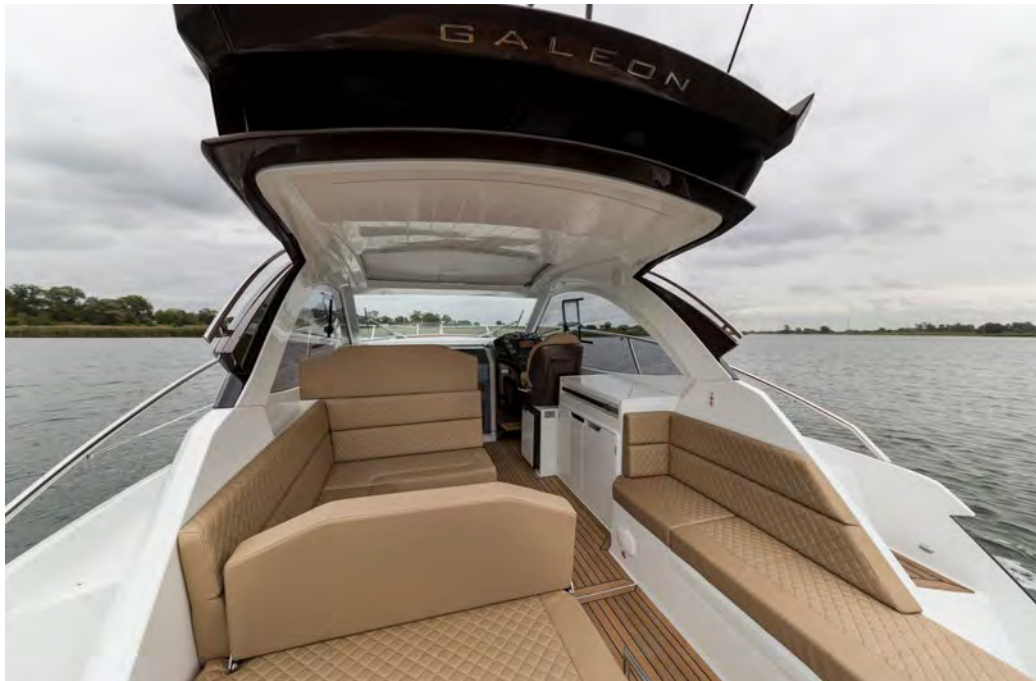
— Plenty of space for fun and relaxation on board of the 335 HTS