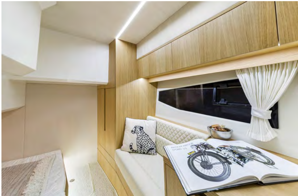
The guest cabin has a large double bed and holds extra storage