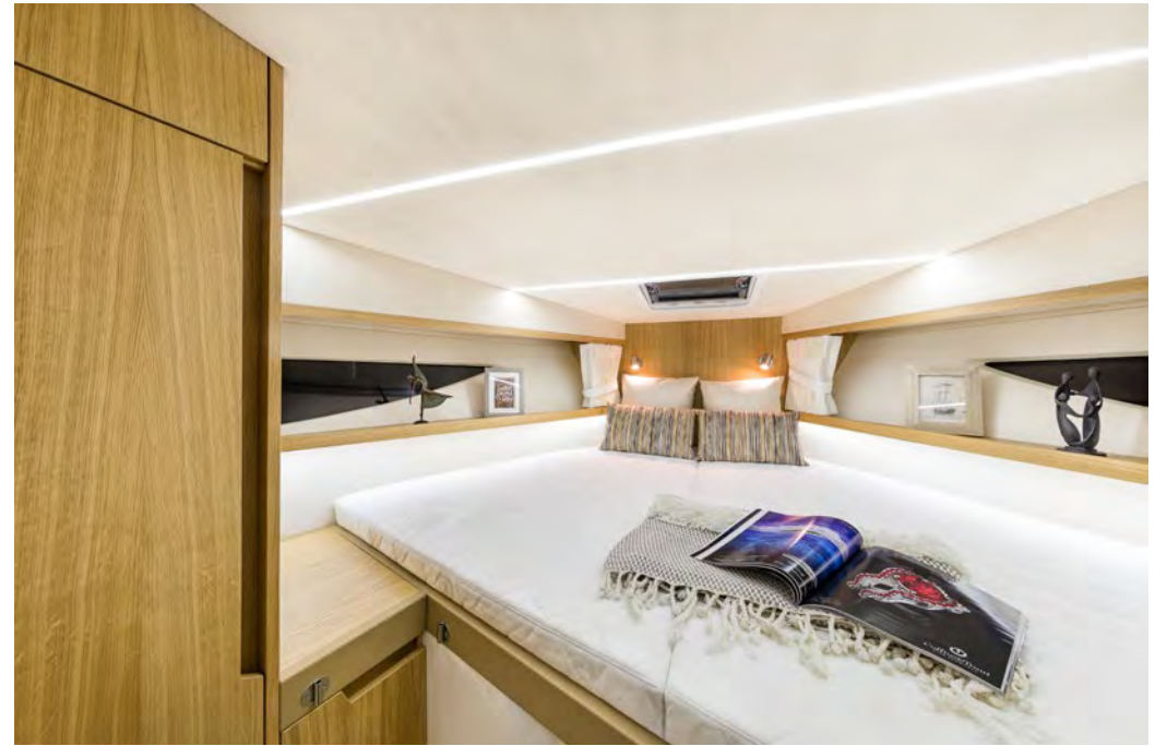
The galley area will hold plenty of supplies