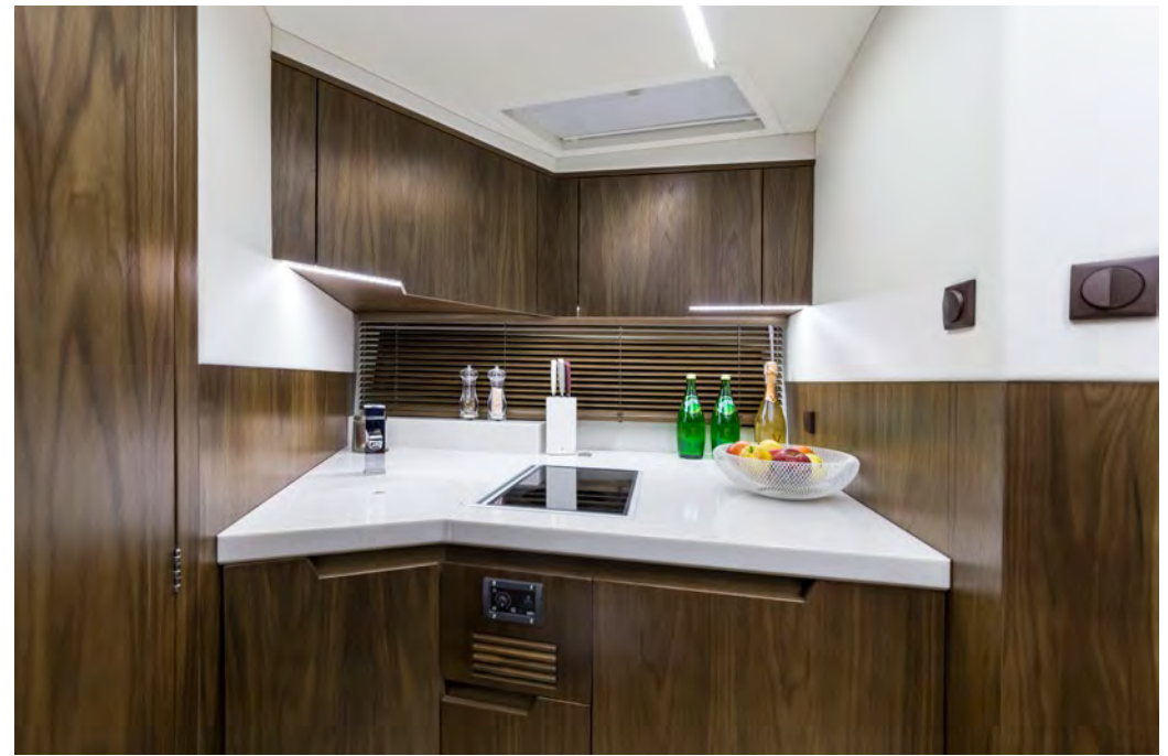
A well equipped galley area