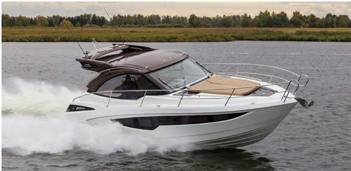
Striking design and smooth cruising of the 335 HTS

A new addition to the Galeon cruiser line-up offers great handling and sport-like performance in any conditions