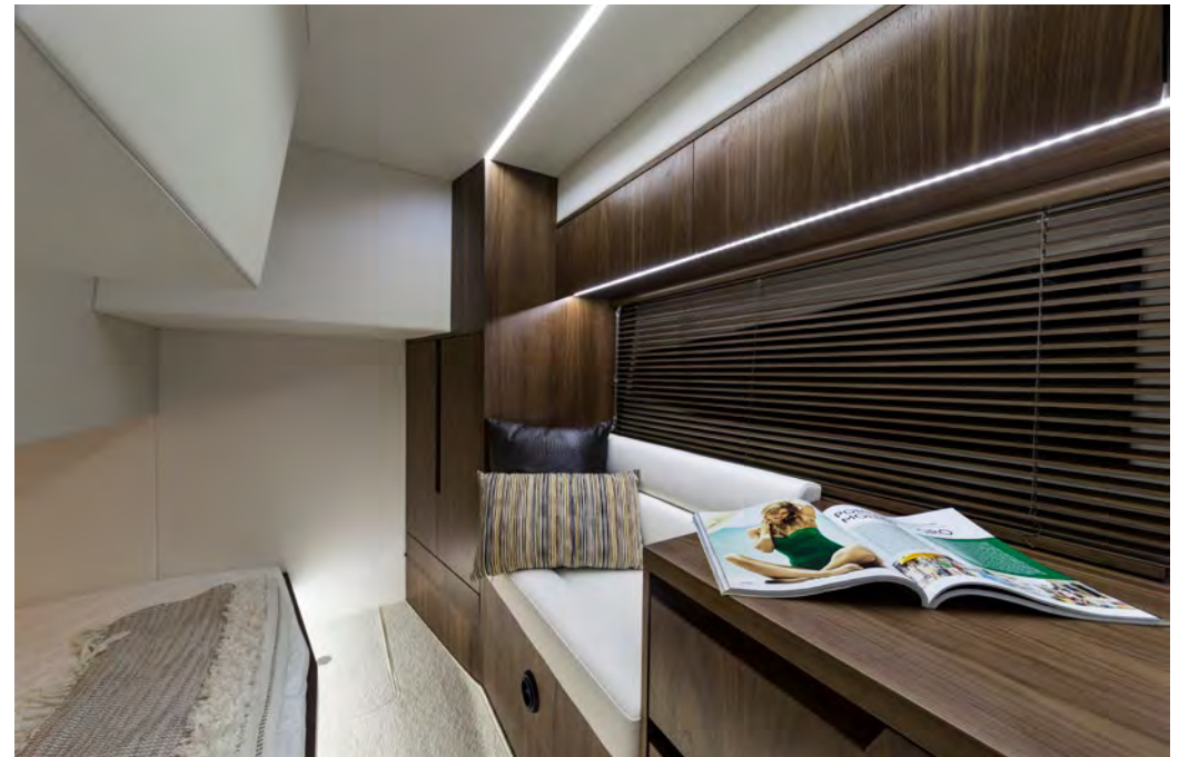
The second cabin with a double bed offers plenty of space