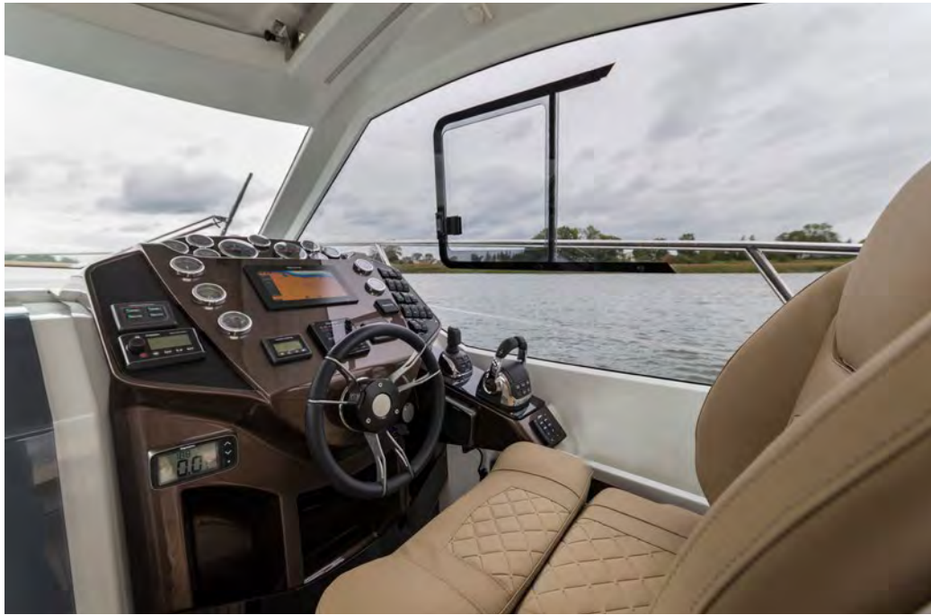
— Precise handling and great visibility from the helm