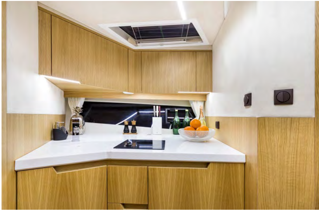
The forward cabin will sleep two