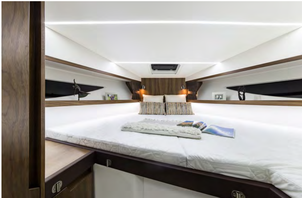
The forward cabin will sleep two with extra space for storage