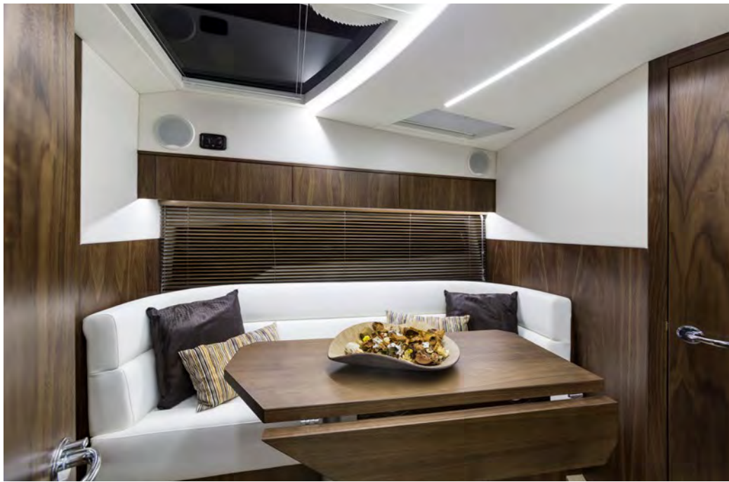
The dining and rest area down below