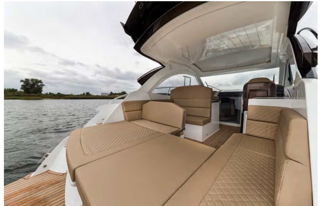
— Use the extra mattress to create a large sundeck facing the aft