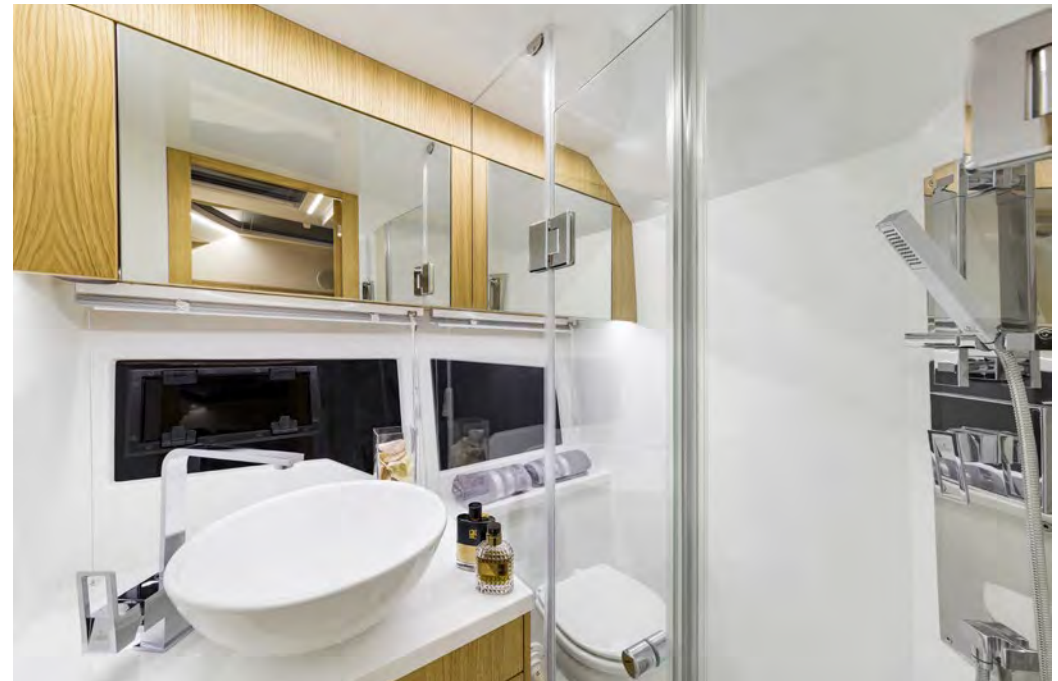
A closed-off shower will help to keep the bathroom dry and tidy