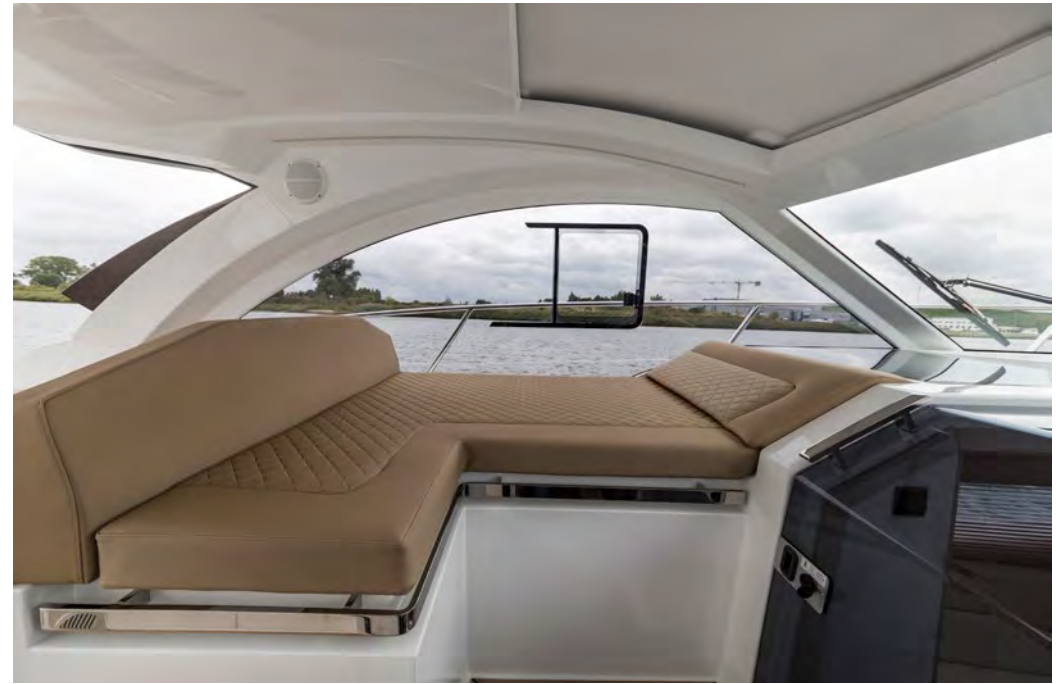
— Extra passenger space up front