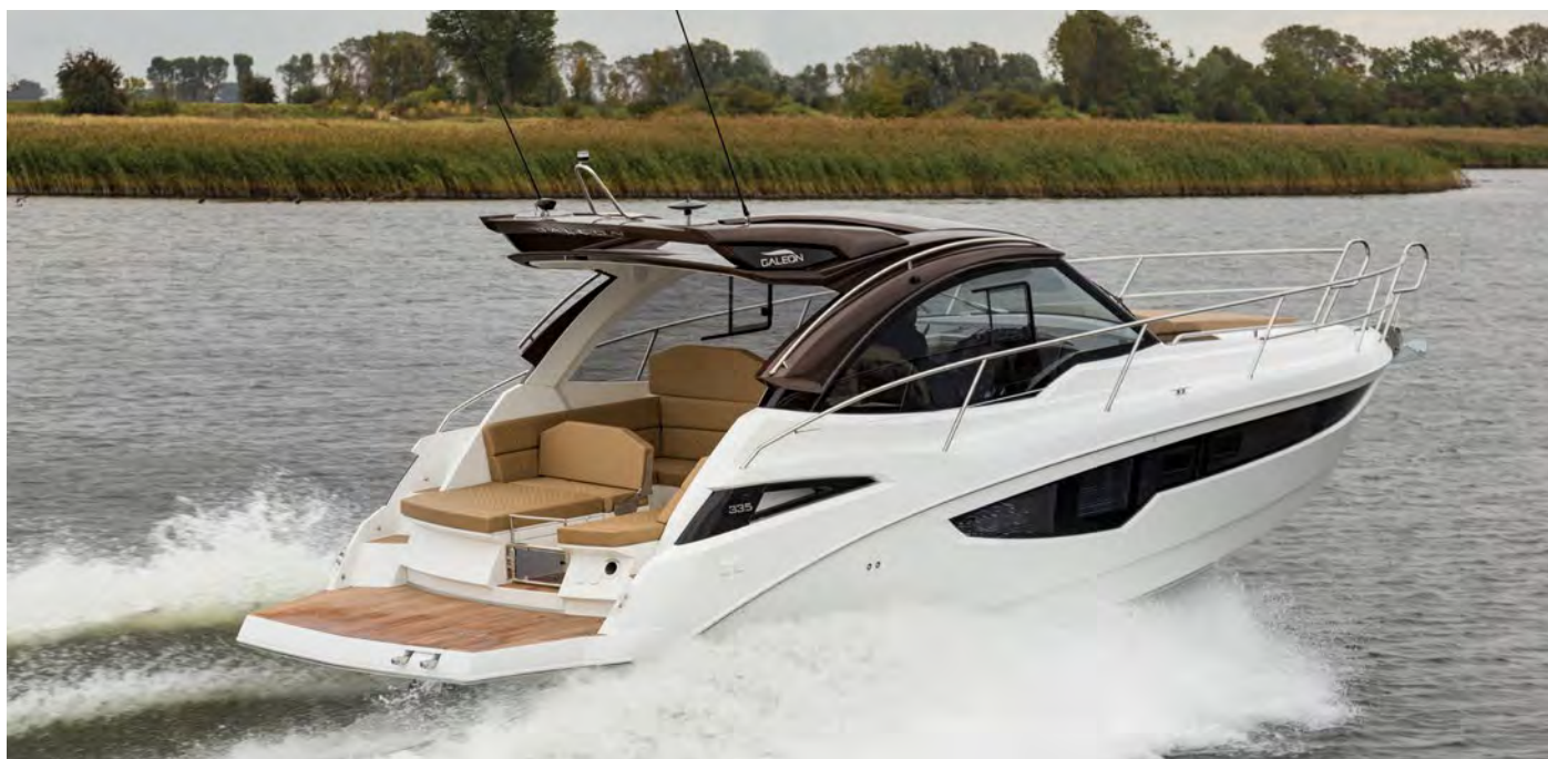
Notice the large bath platform for water based activities