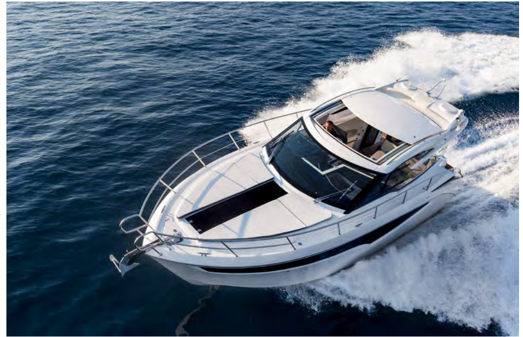
Supreme handling and performance —