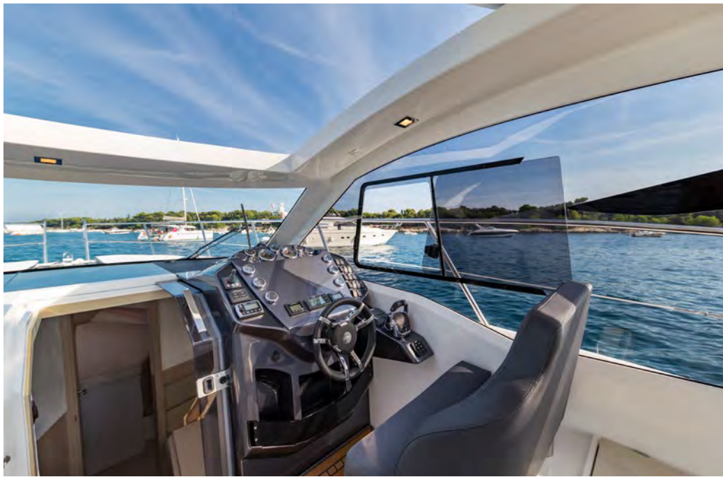
— Open the sunroof and slide the window the let the air in