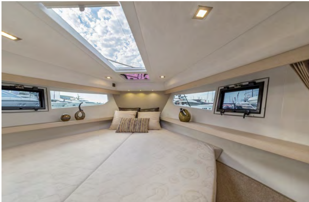
Forward cabin with a magnificent skylight above —