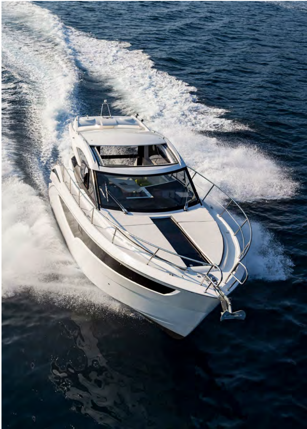
Slide the roof open to let the breeze in —