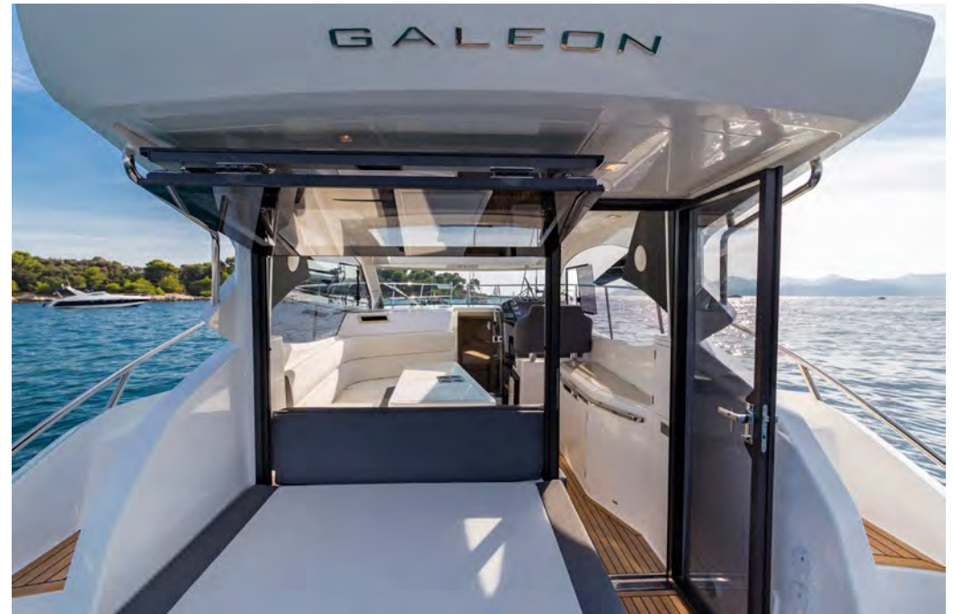
— Closed or open cockpit- you decide!