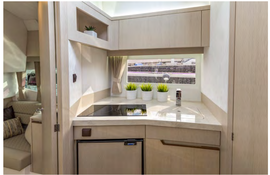
A convenient galley can be found down below —