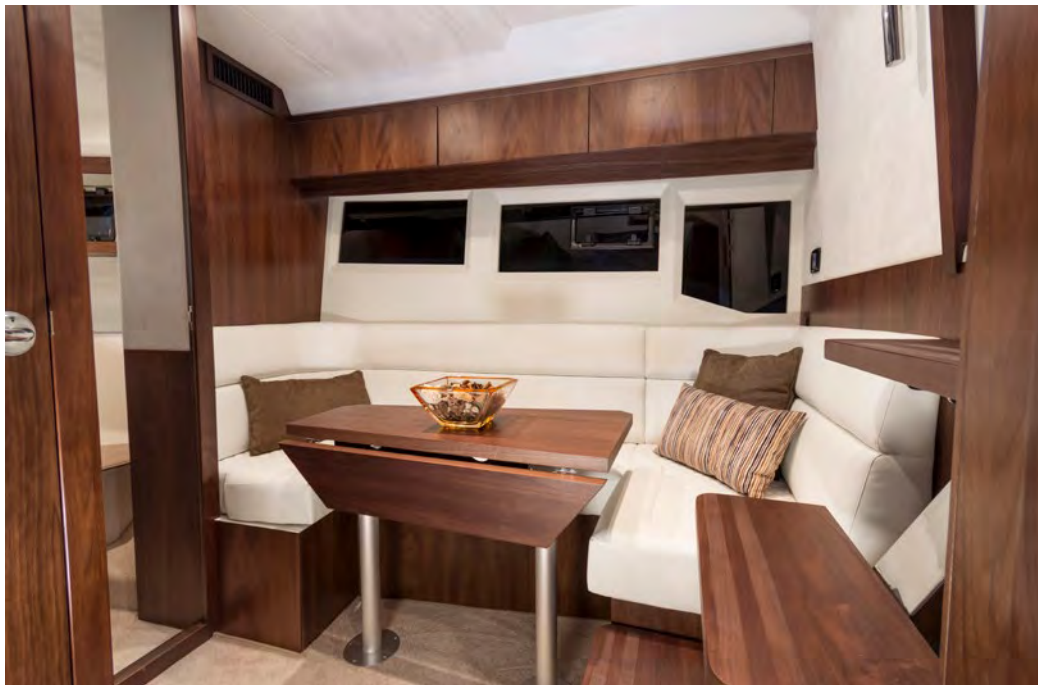
A rest and dining area in the saloon —