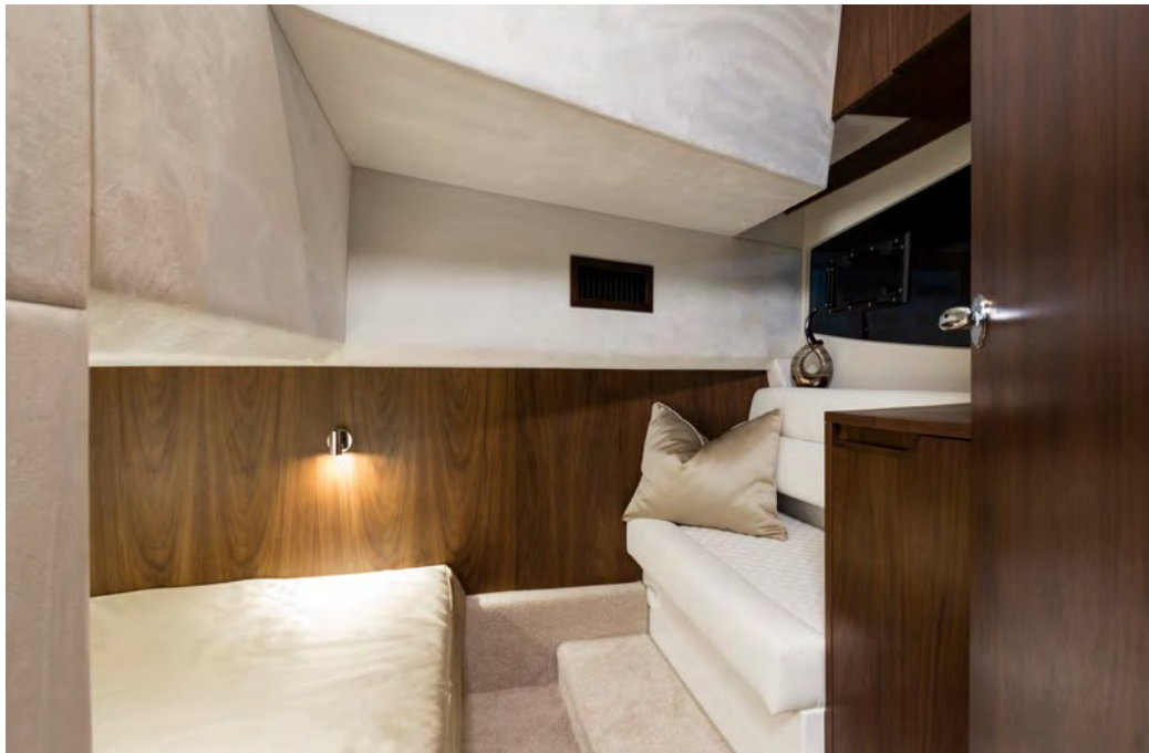
Double bed and a rest area for the guests —