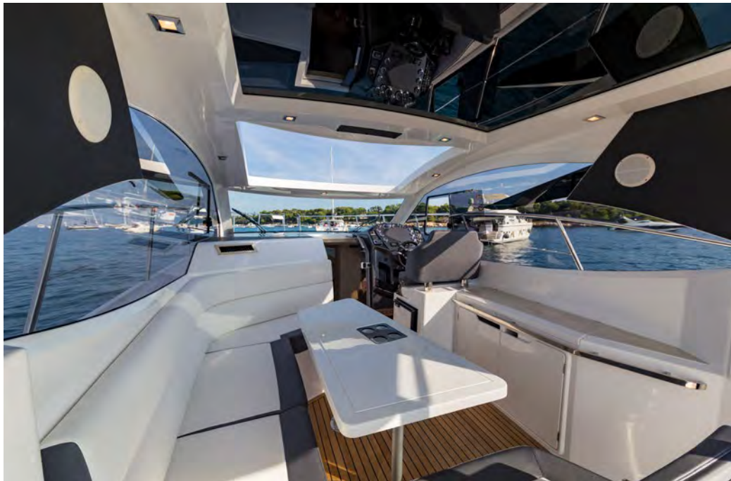
— A wet bar on the main deck