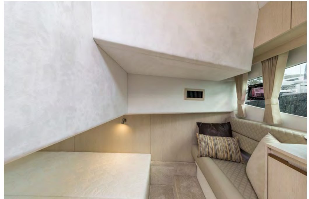
Double bed and a rest area in the guest cabin —