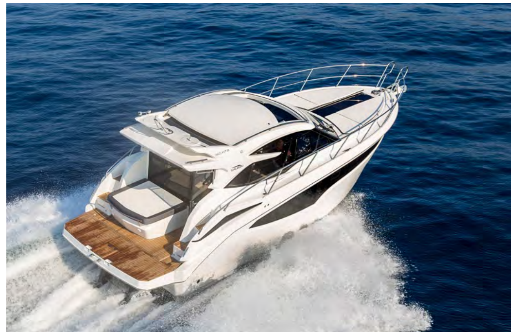
Close the cockpit doors for a quieter ride —