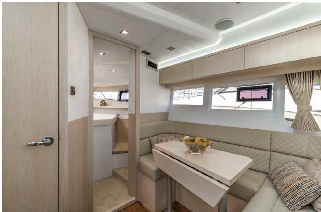
Extend the table or take it out completely to create extra space —