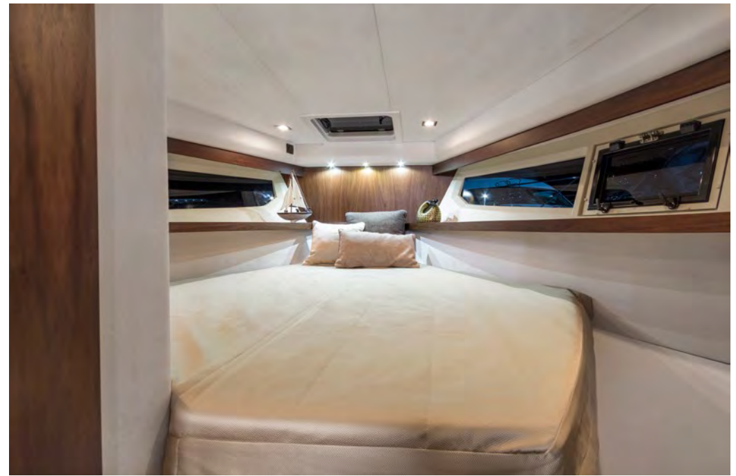
The bow cabin offers a double bed —