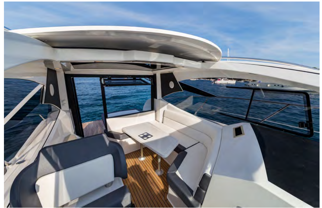
— Great visibility all around