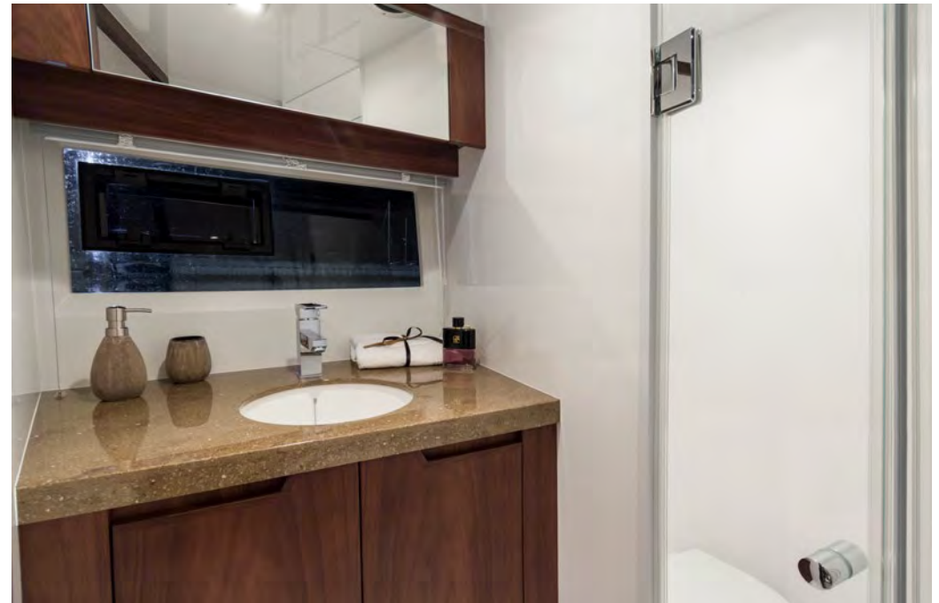
The bathroom holds a head and a shower —