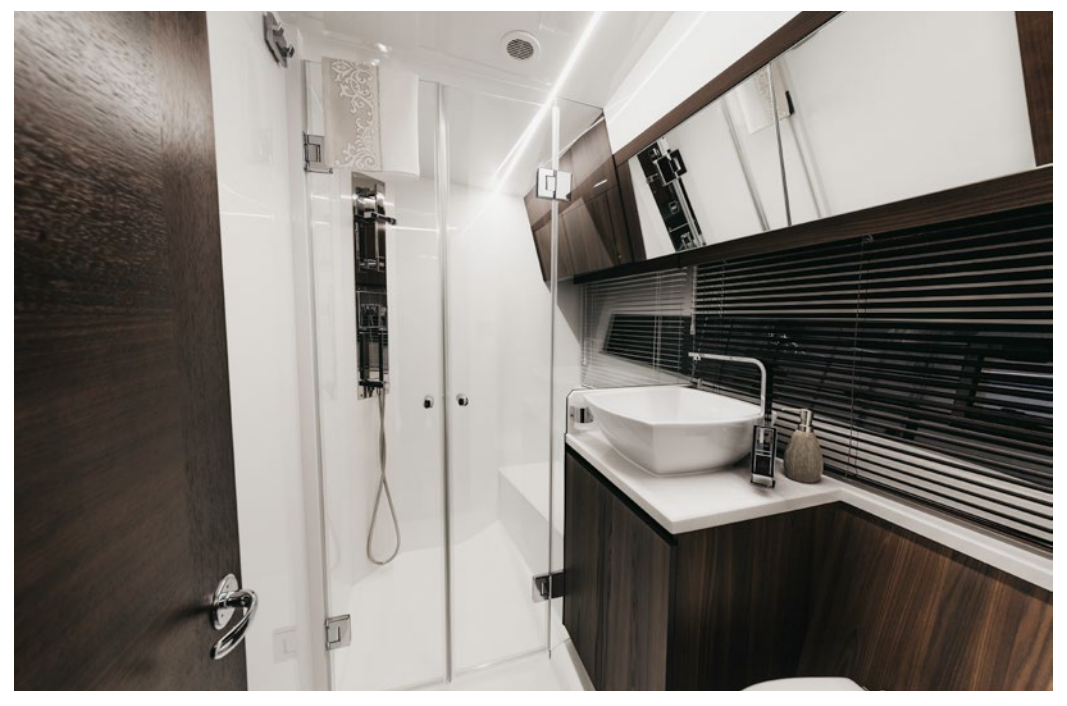
The owner's cabin has private access to the bathroom —