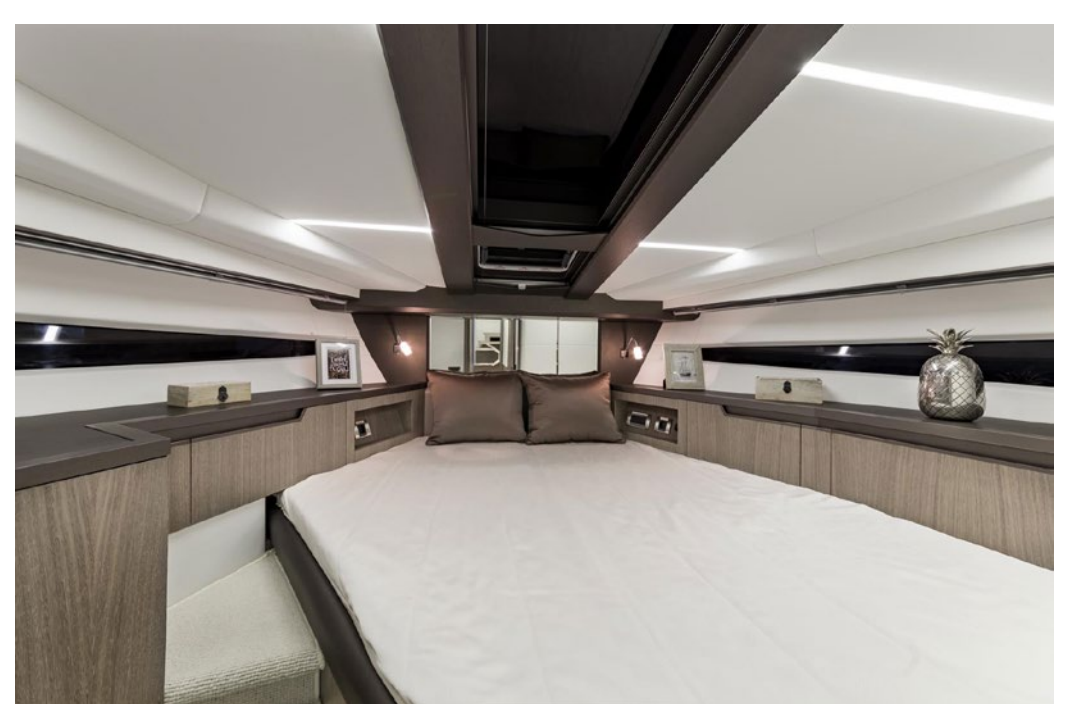
The guest's cabin holds a double bed and extra storage