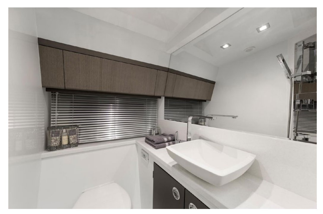
One of the two bathrooms down below

Saloon with a galley area and a sizable dinette —