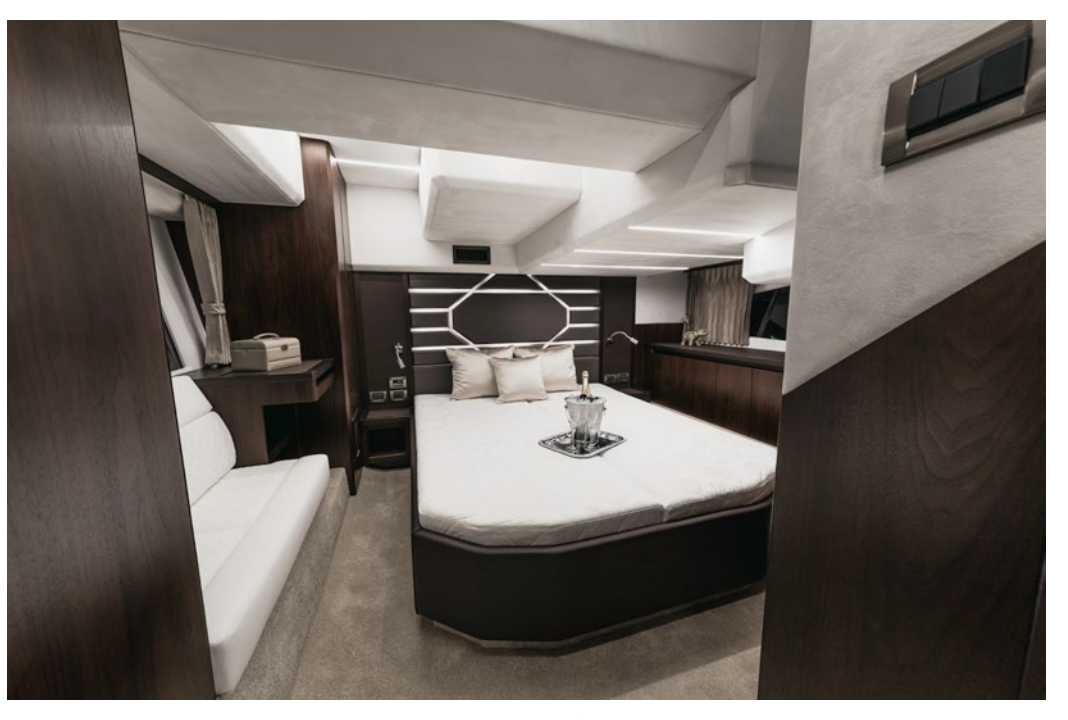
The owner's cabin offers great space and a smart arrangement —