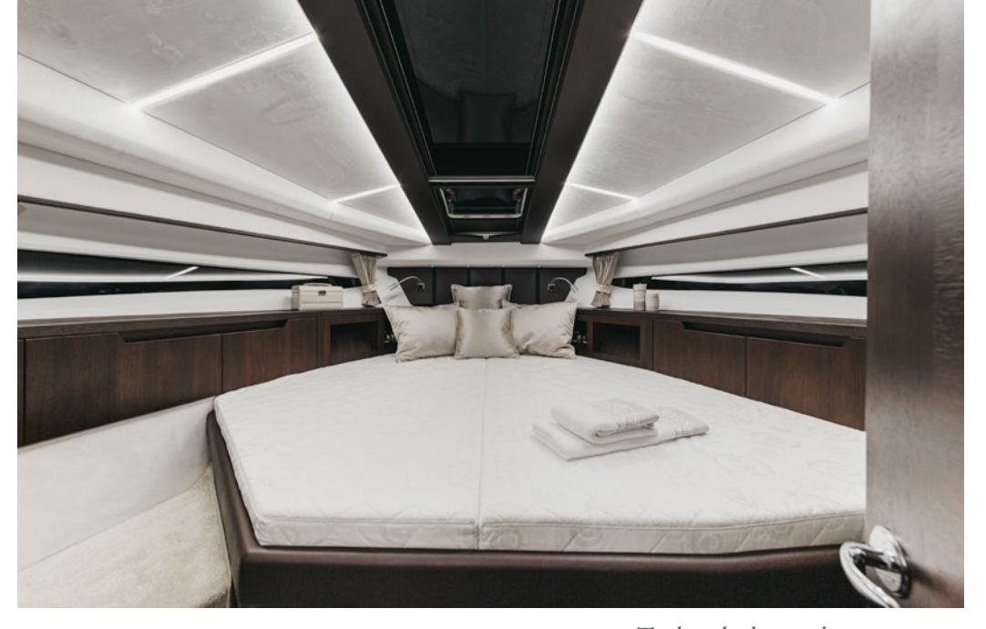
The bow bedroom sleeps two

A well-lit saloon is located below deck —