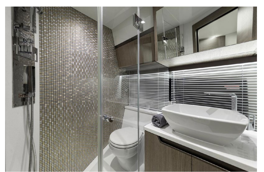
High quality fixtures in bathrooms —