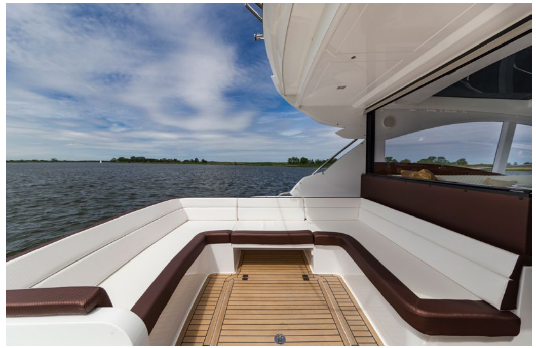
— Outside rest area