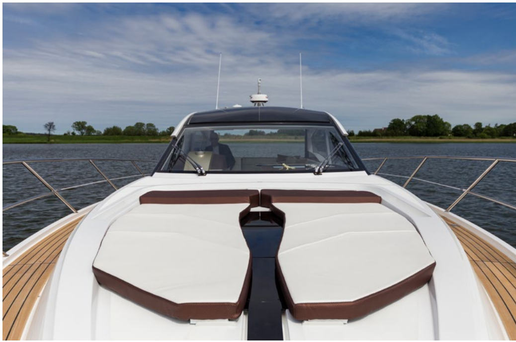
— Bow sundeck area