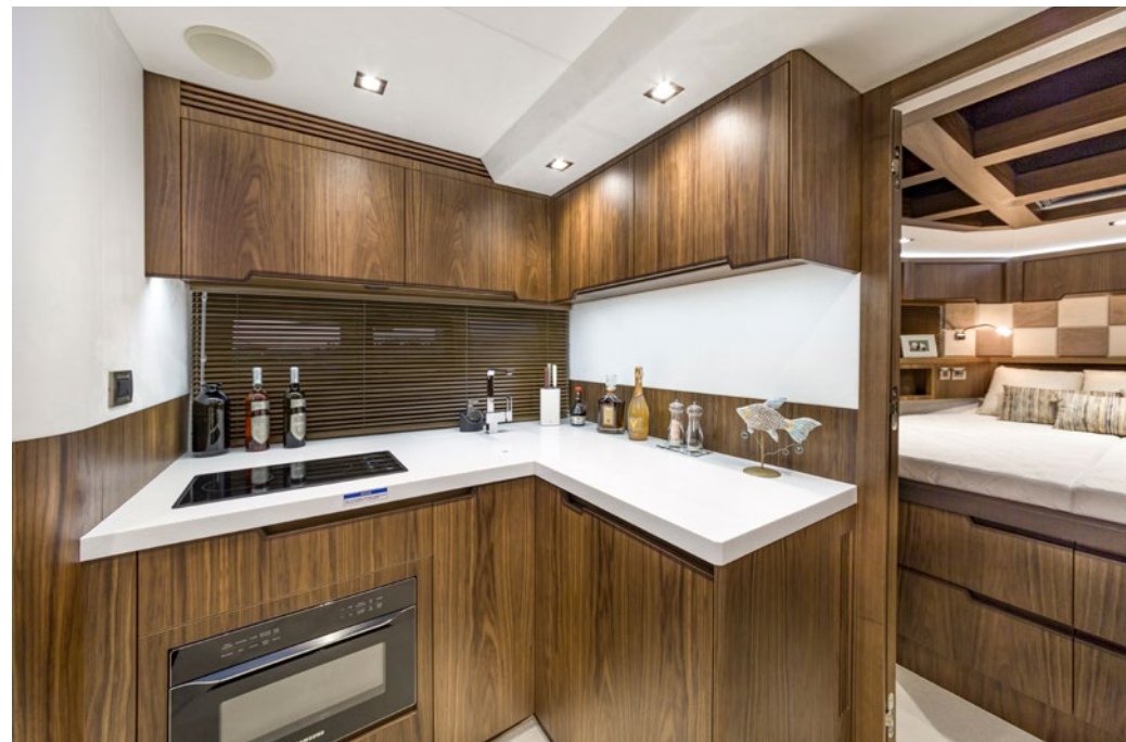
The compact galley will store all the necessities —