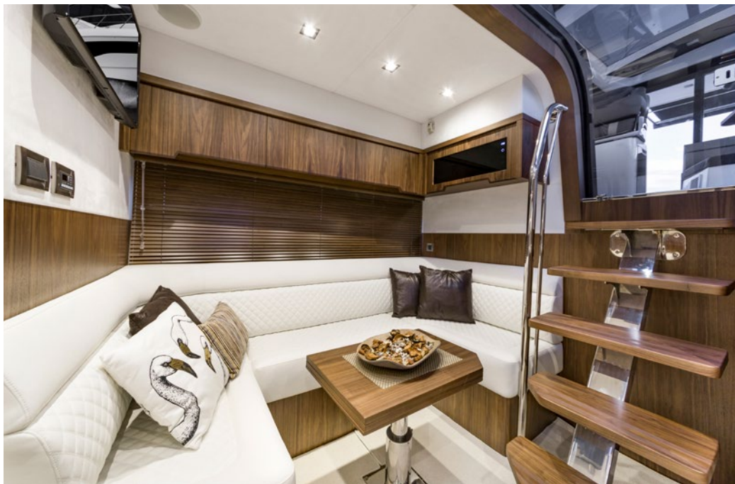
A dinette with a fold-out table —