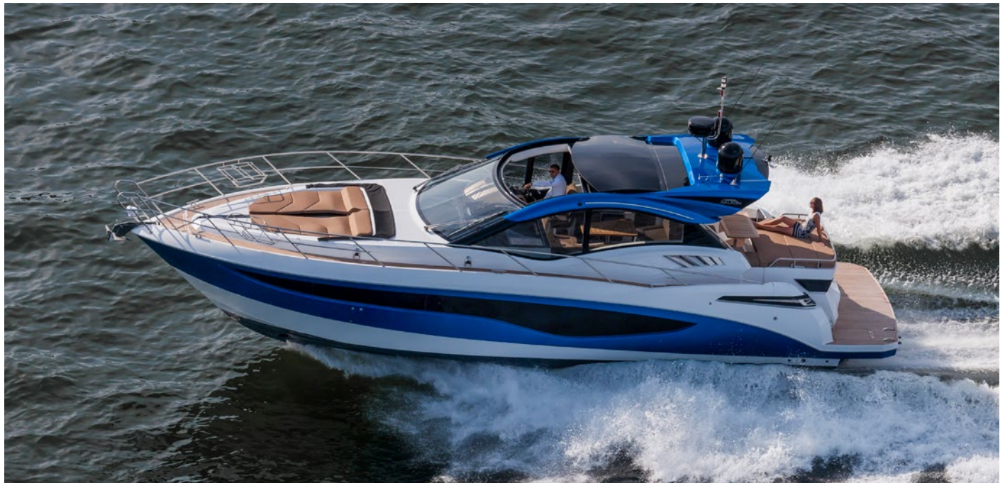
Perfect proportions compliment the sleek design —