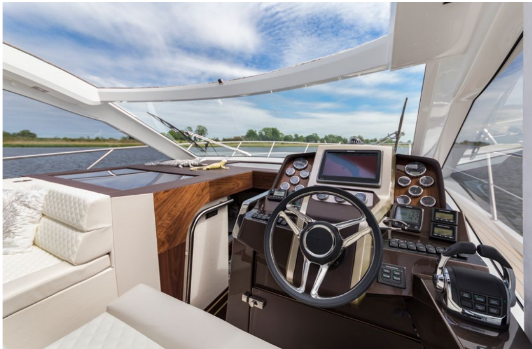
— Slide the sunroof and enjoy the breeze