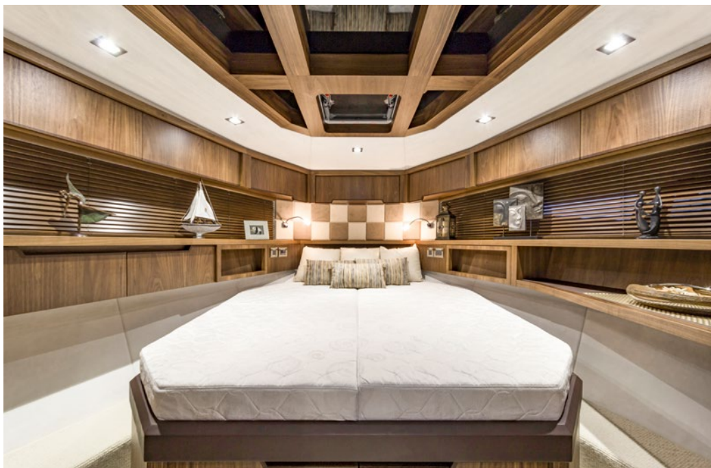
Forward VIP guest cabin with skylights above —