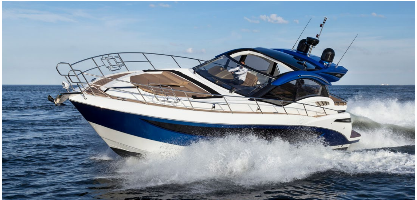
A sporty disposition of the 485 HTS —