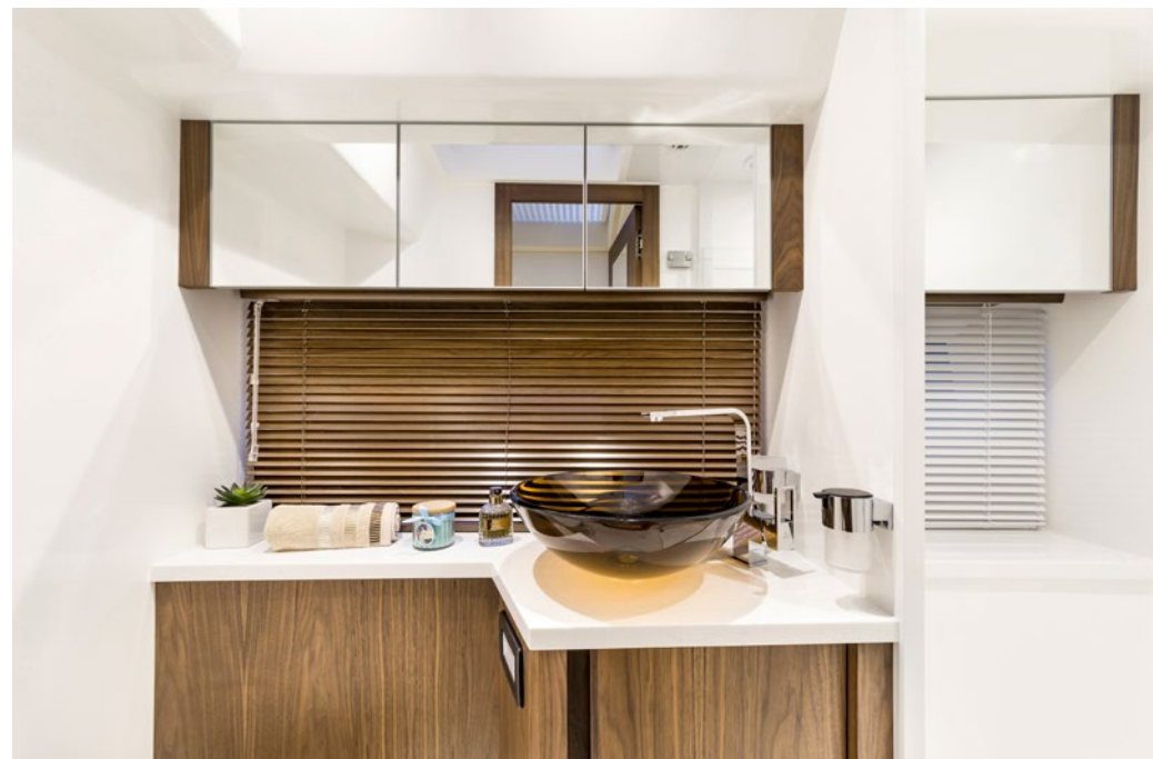
One of the two bathrooms below deck —