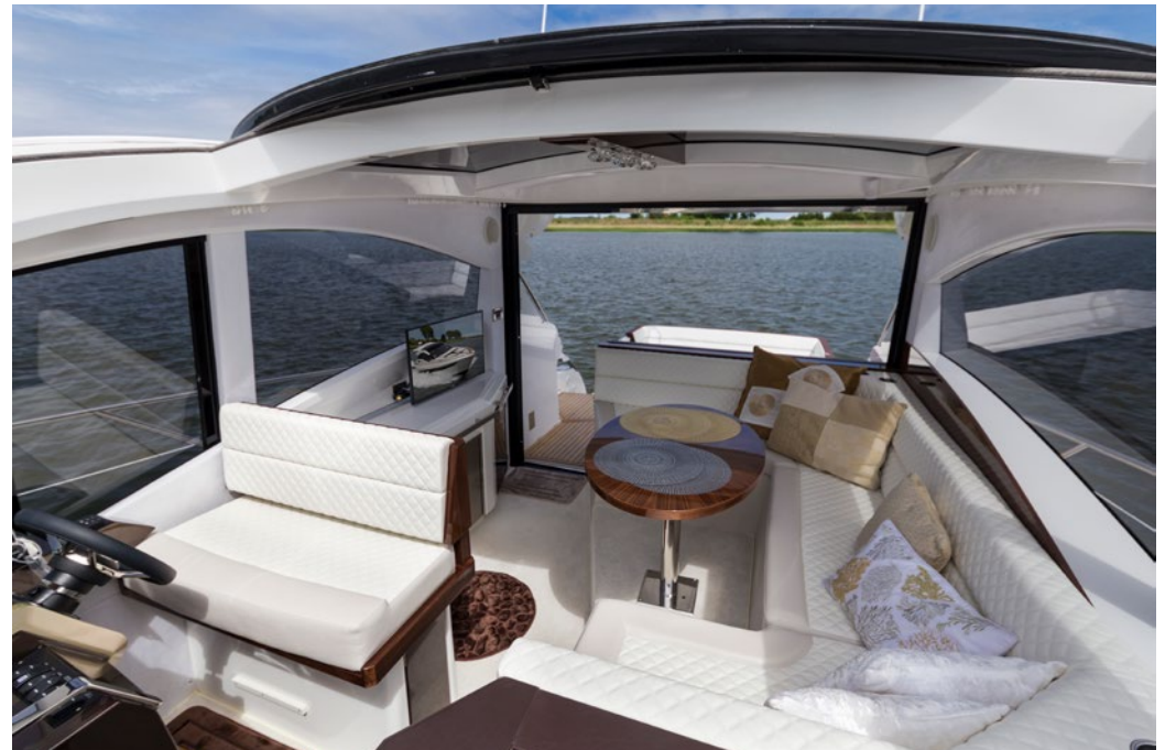
— Open the glass door and drop the window for an open cockpit experience