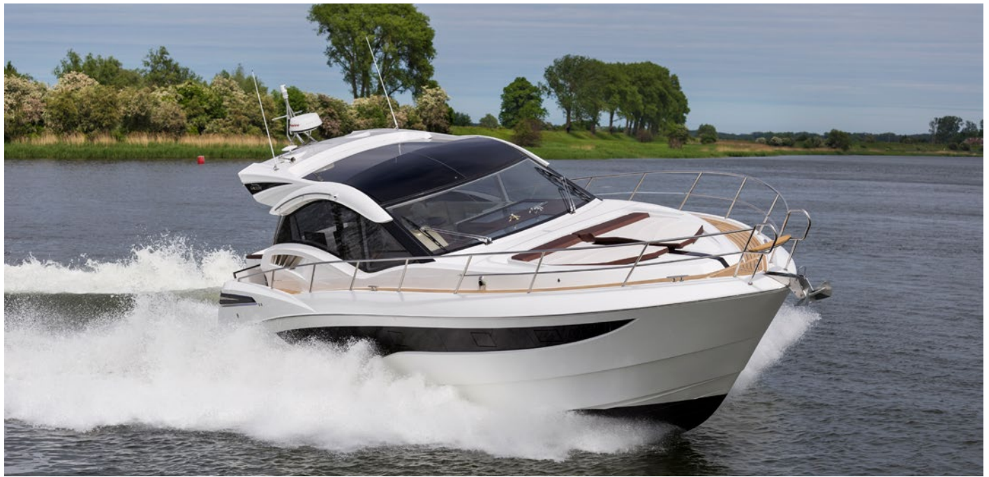
Tight handling and great performance