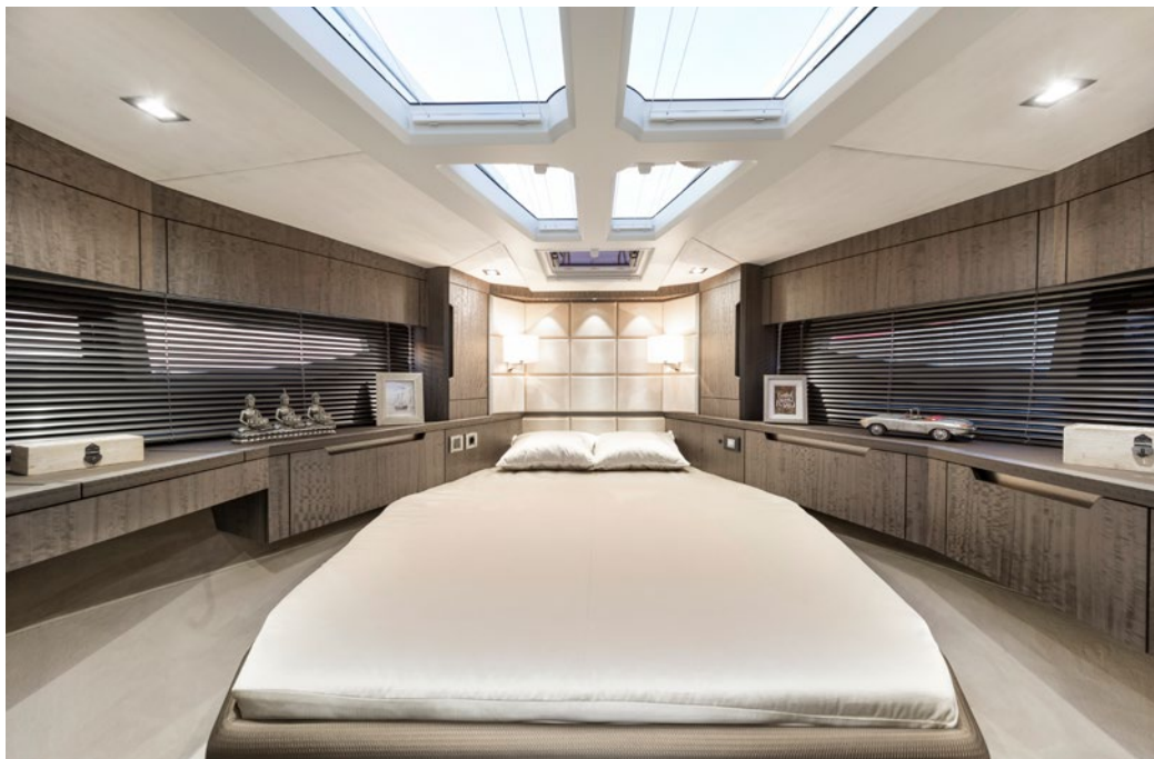
Forward VIP cabin with plenty of storage