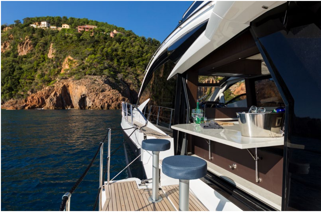
— Serve refreshments to the outside bar—amazing!