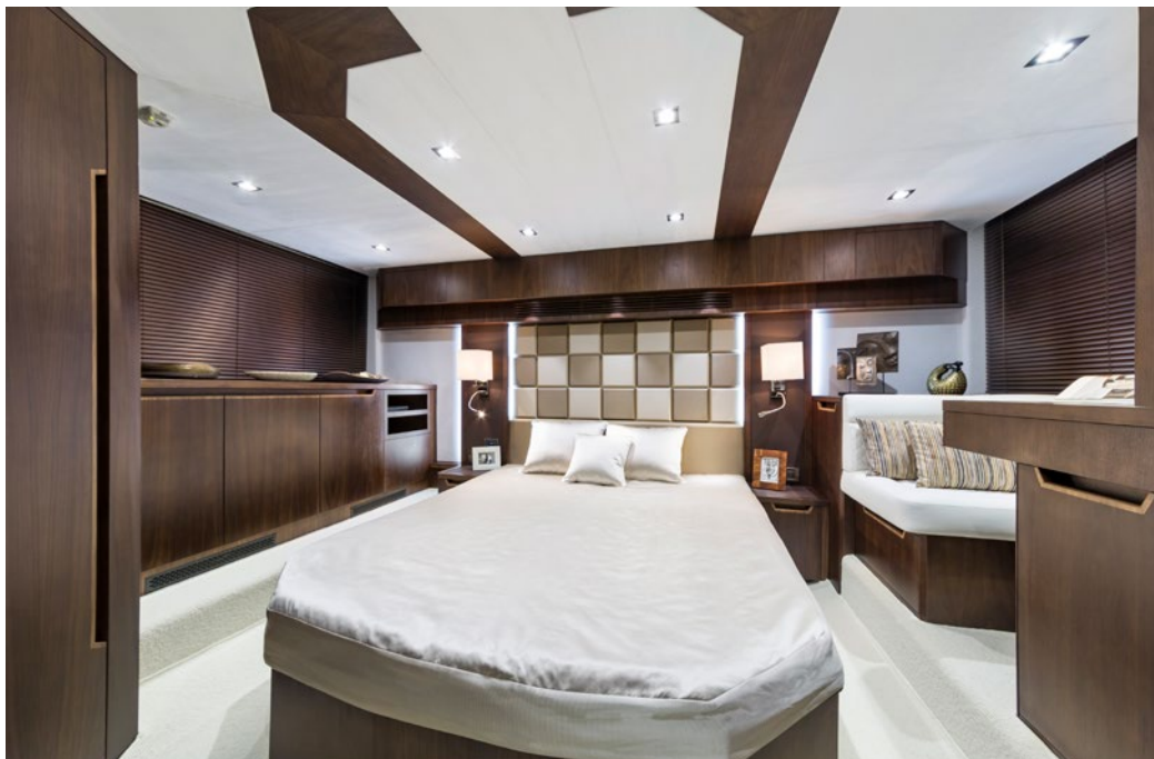
Owner's cabin with standing height all around —