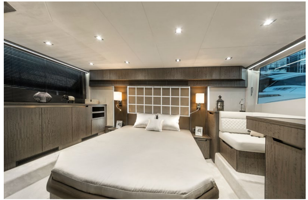
The owner's cabin offers great space and a clever arrangement