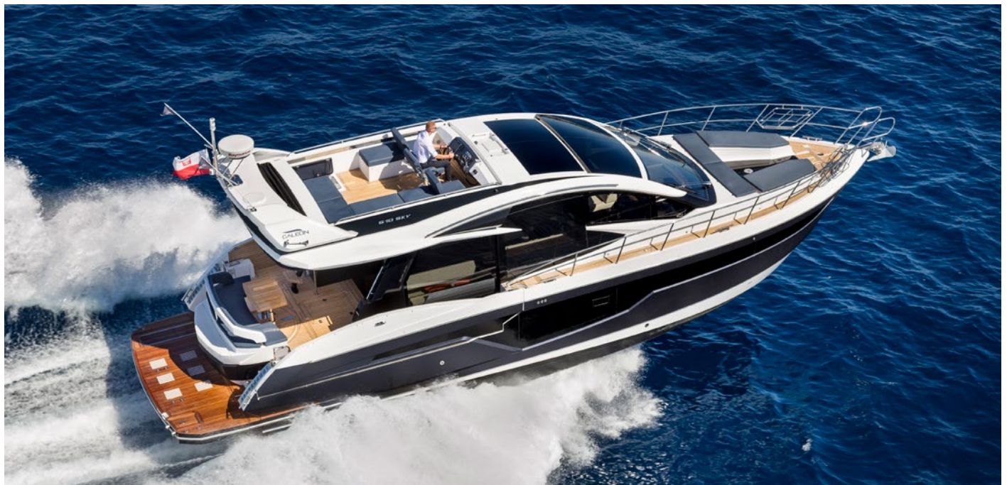
The SKYDECK boasts extravagant design, yet remains surprisingly practical —