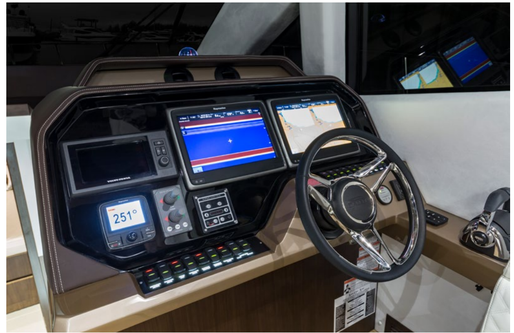
Helm station gives total command of the yacht —