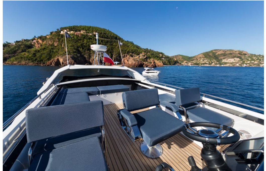
— Top deck offers sufficient space and can be closed off completely