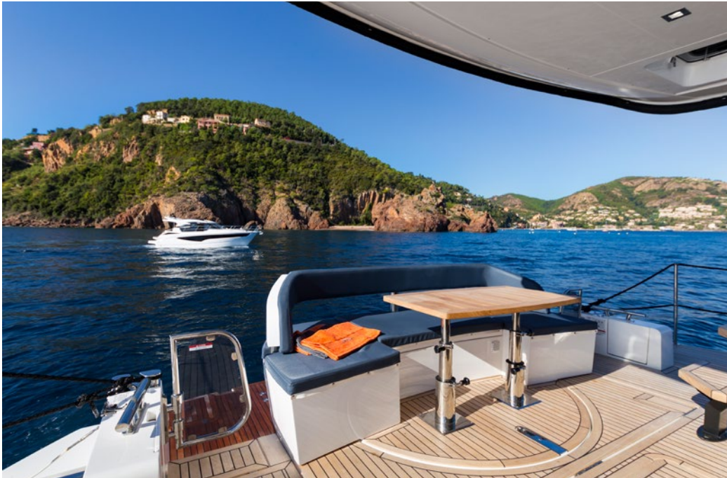
— Rotate the aft seat in any direction