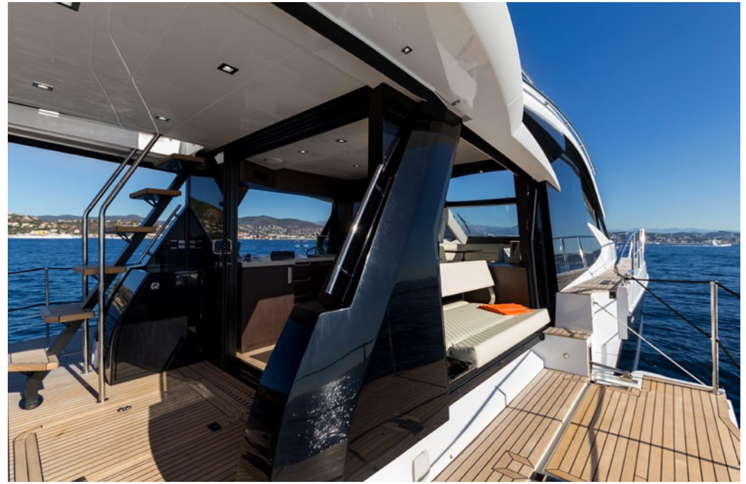
— Lots of extra space thanks to Beach Mode