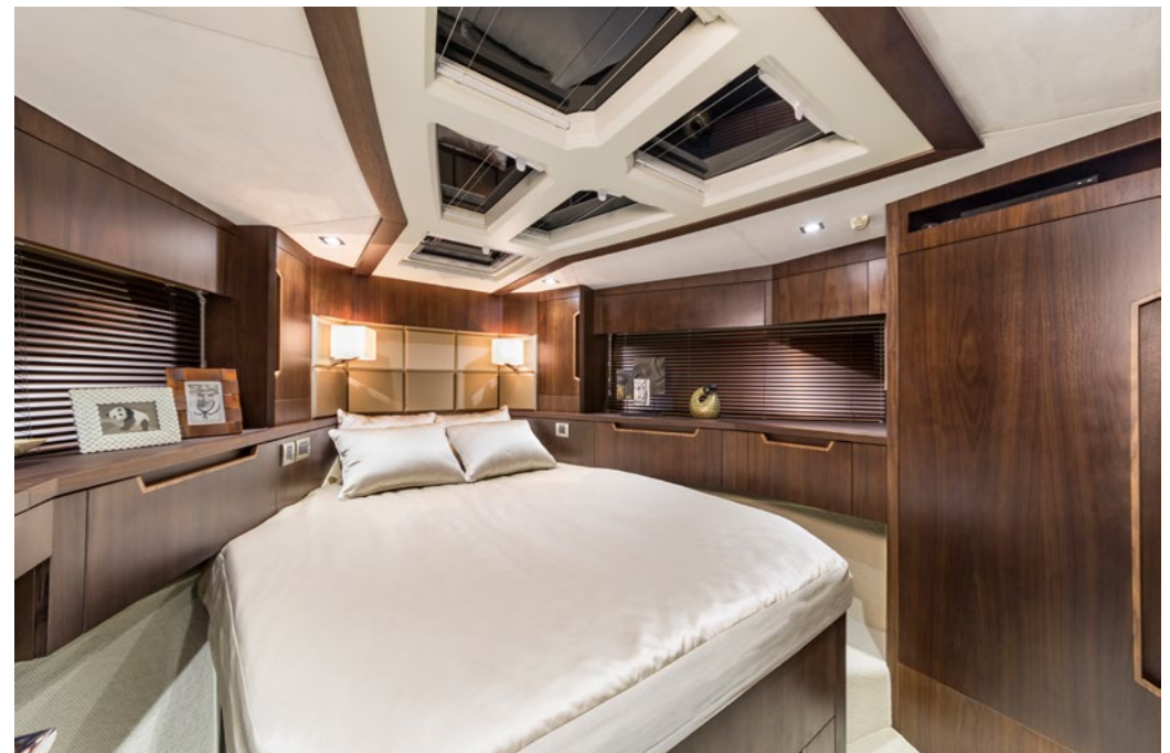
Forward VIP guest cabin with bathroom access —