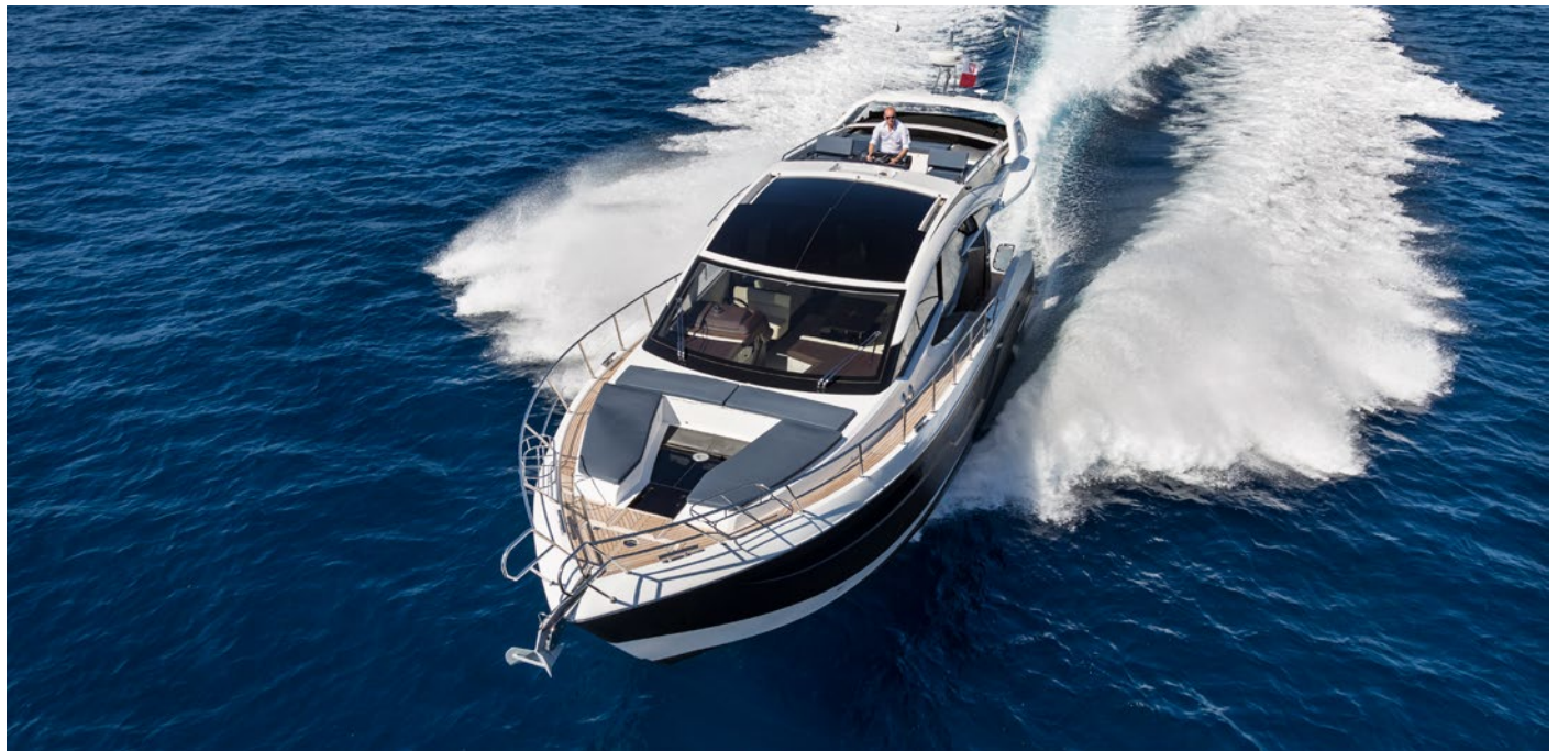
Incredible performance thanks to the Volvo IPS engine option —