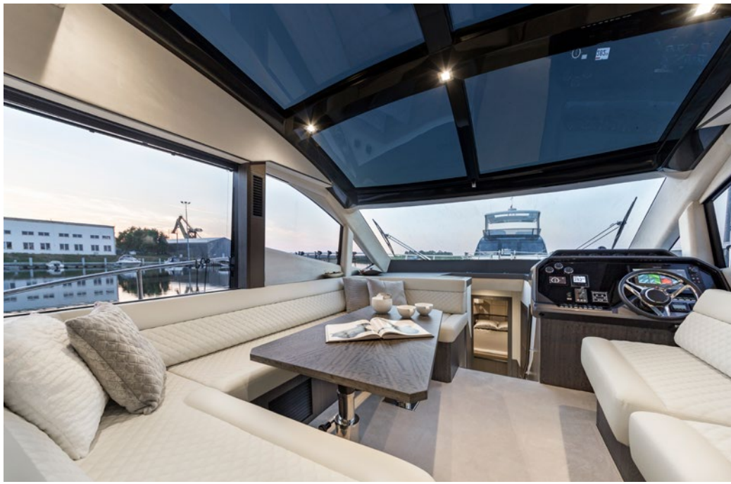
Notice the large sunroof over the entertainment area