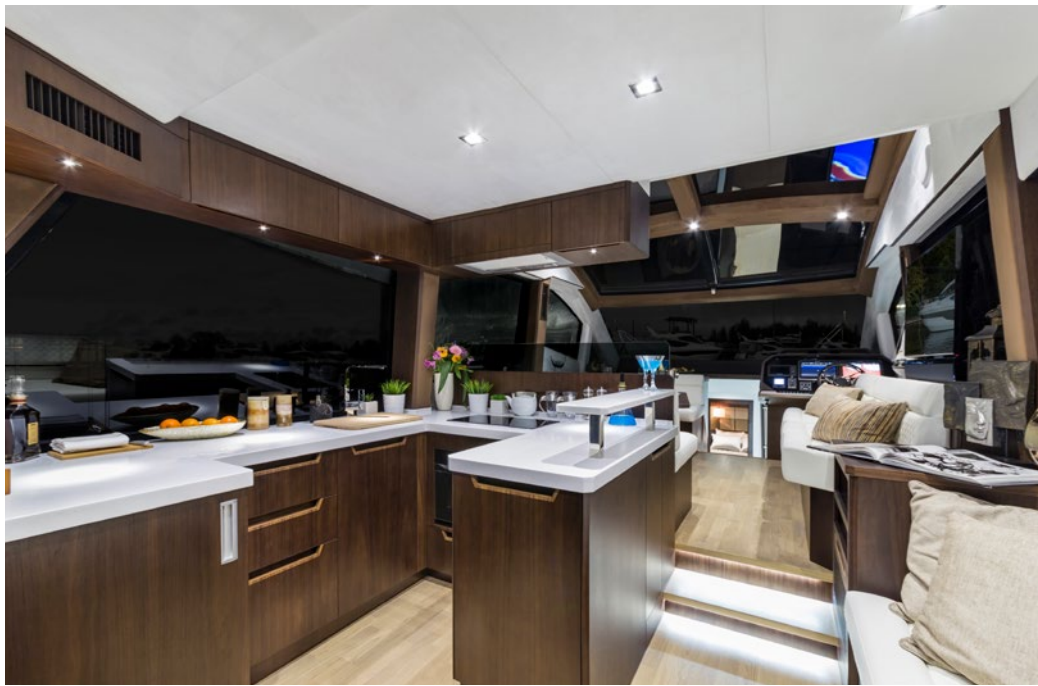
A full-sized galley —