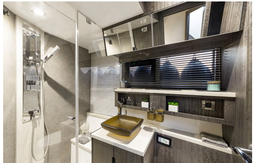
High quality fixtures in both batrooms