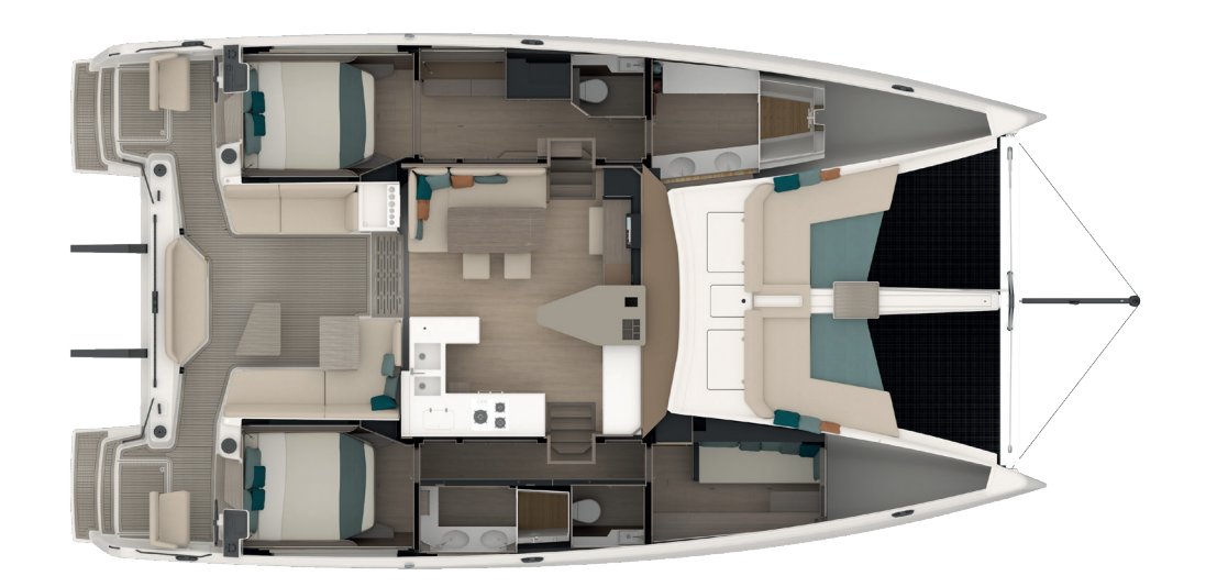
2 cabines, 2 heads + Smartroom® FLEXIBILITY