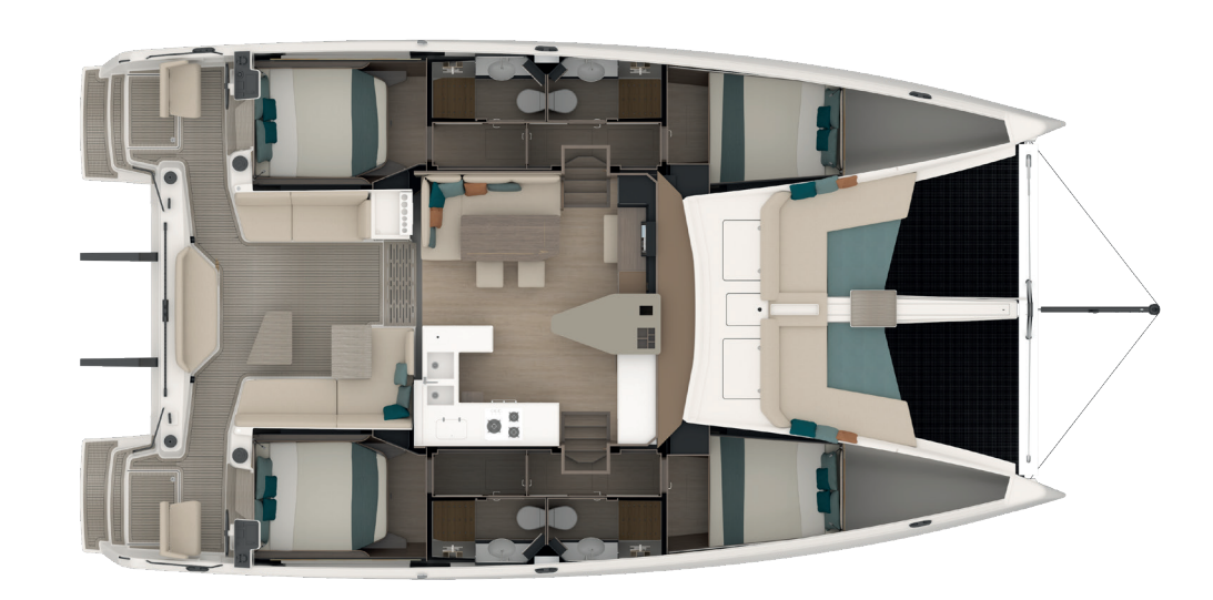
4 cabines, 4 heads