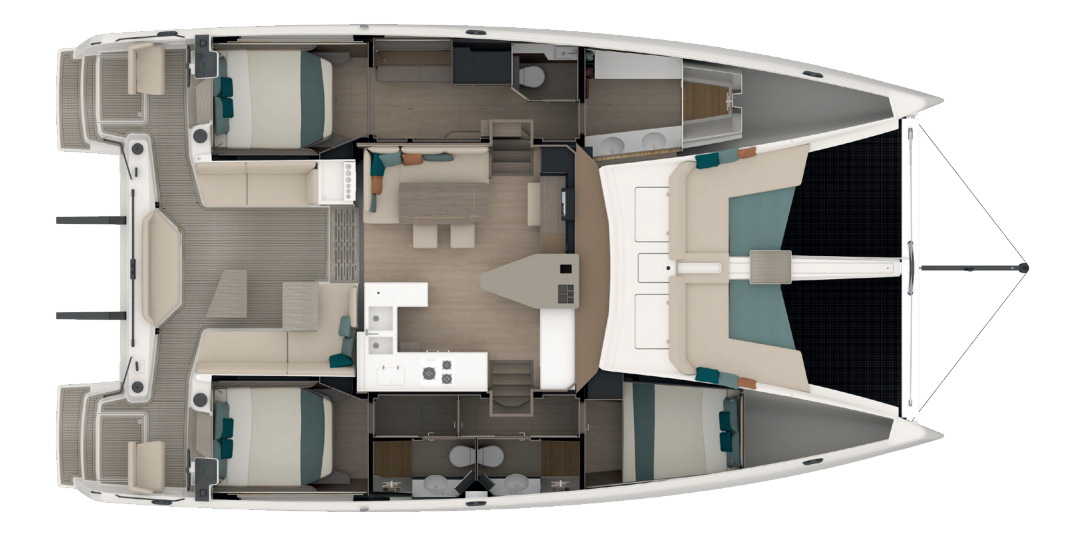
3 cabines, 3 heads, owner suite