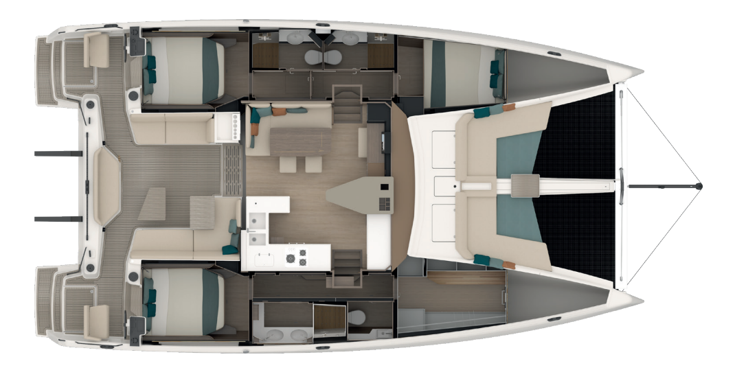
3 cabines, 3 heads + SmartRoom® FLEXIBILITY