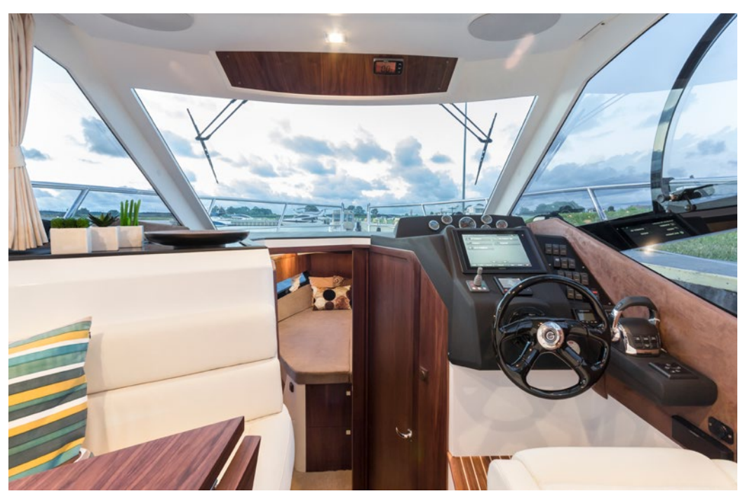
The side window can be opened manually to let the breeze in