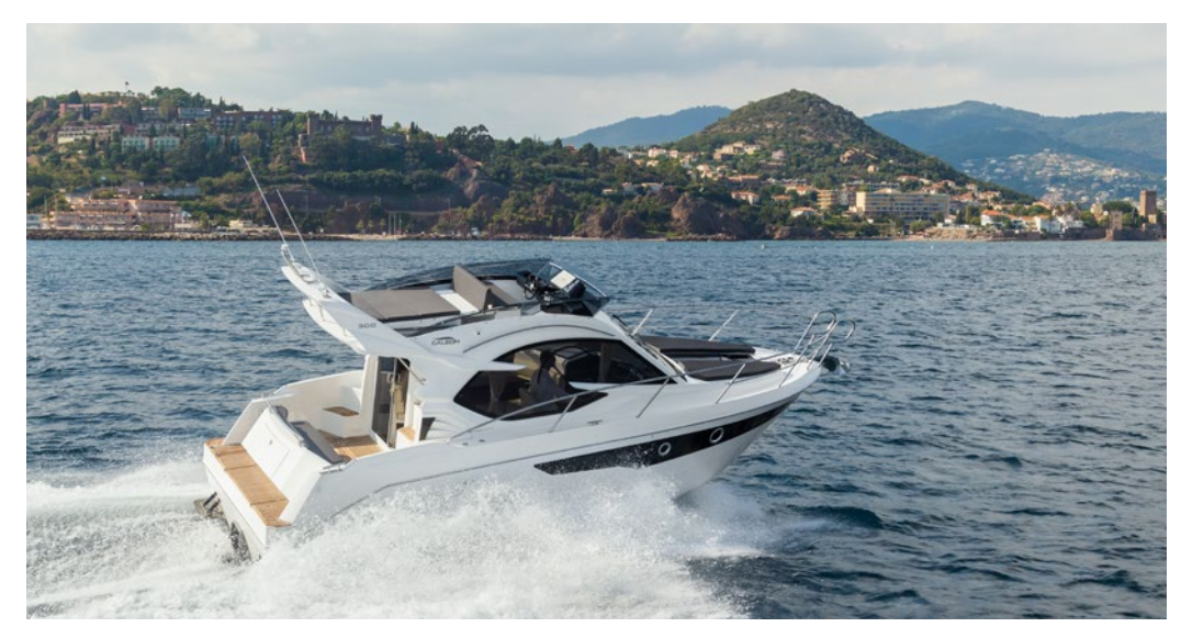
Swift handling in all weather conditions