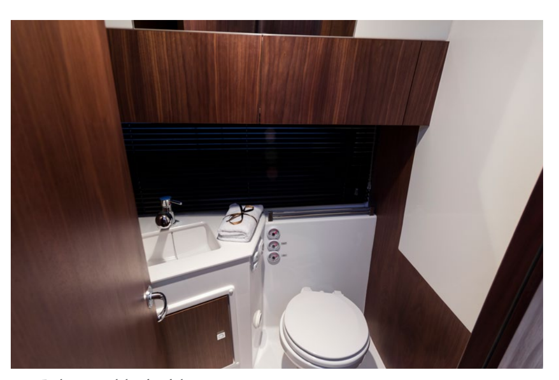
Bathroom with head and shower