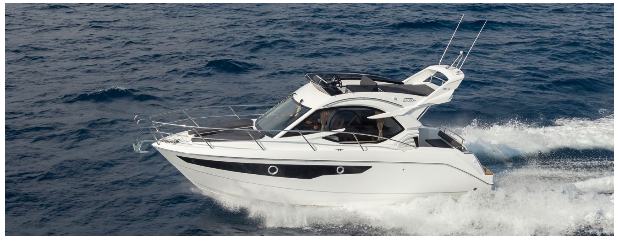
The entry level flybridge model offers plenty of space on board