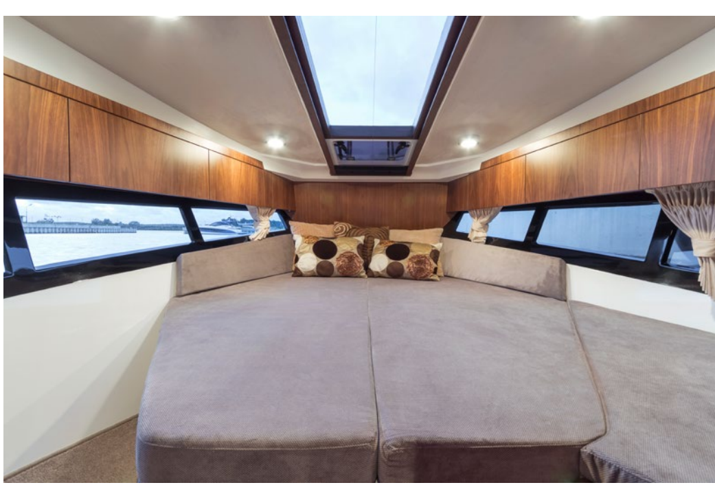
Forward owner's cabin with double bed