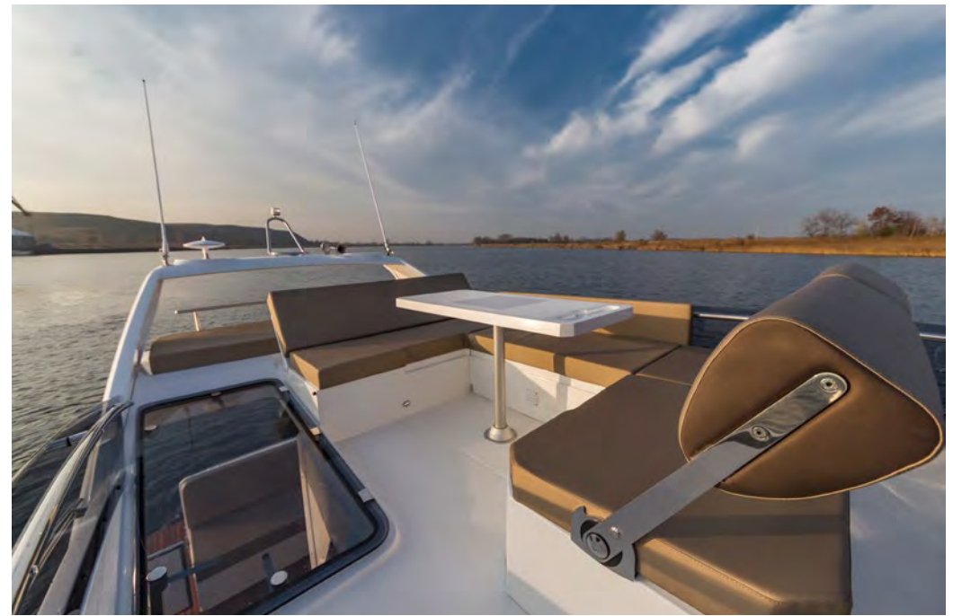
— Plenty of space for activities and leisure