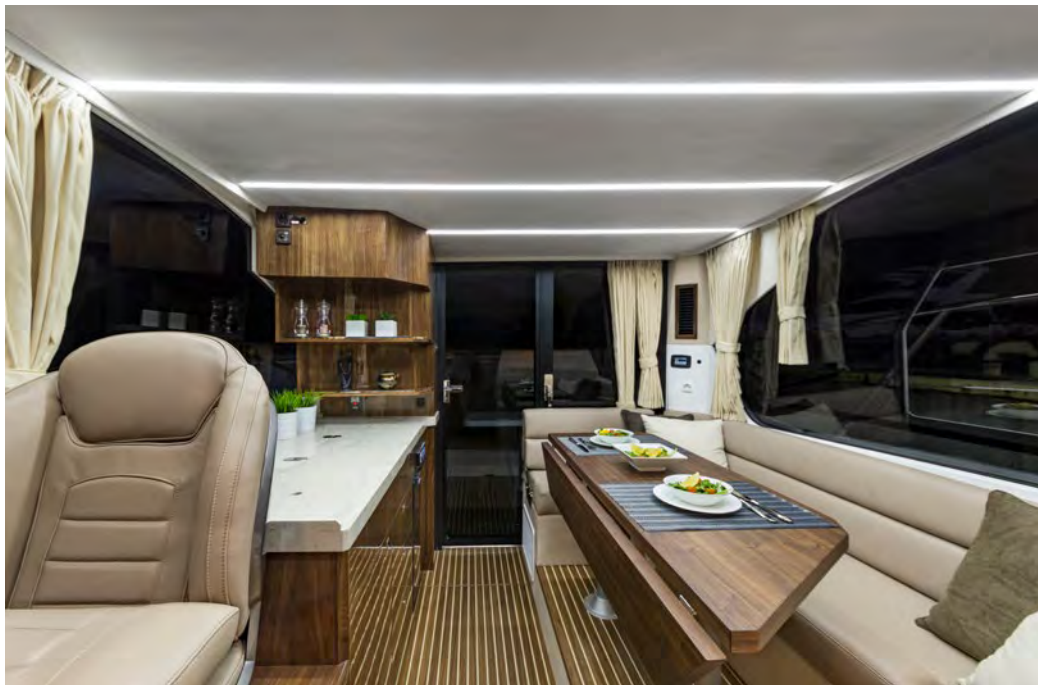
Find a galley and a dinette in the saloon —