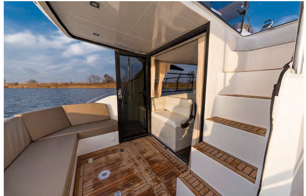
— The cockpit offers easy access to the saloon and flybridge areas