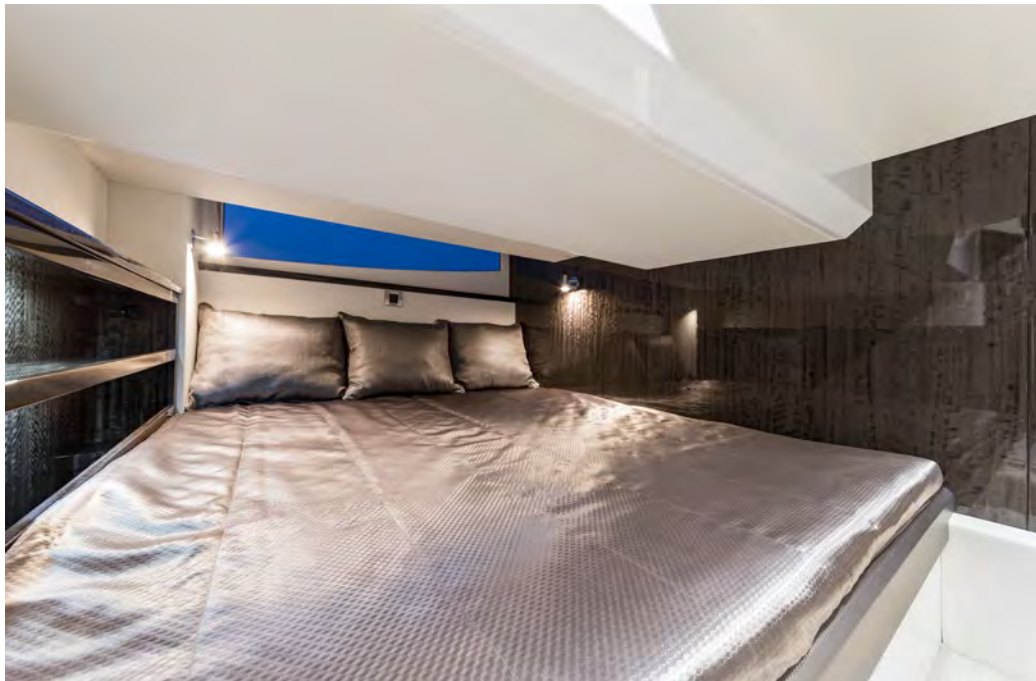
A large bed in the guest cabin down below