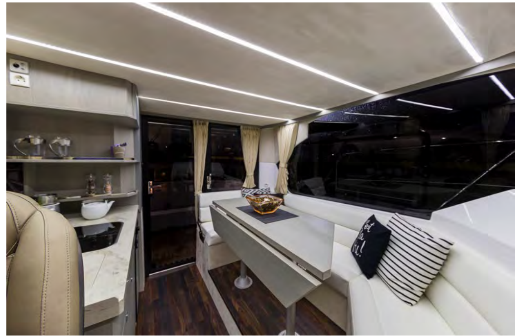
— The table can be propped up for extra dining space