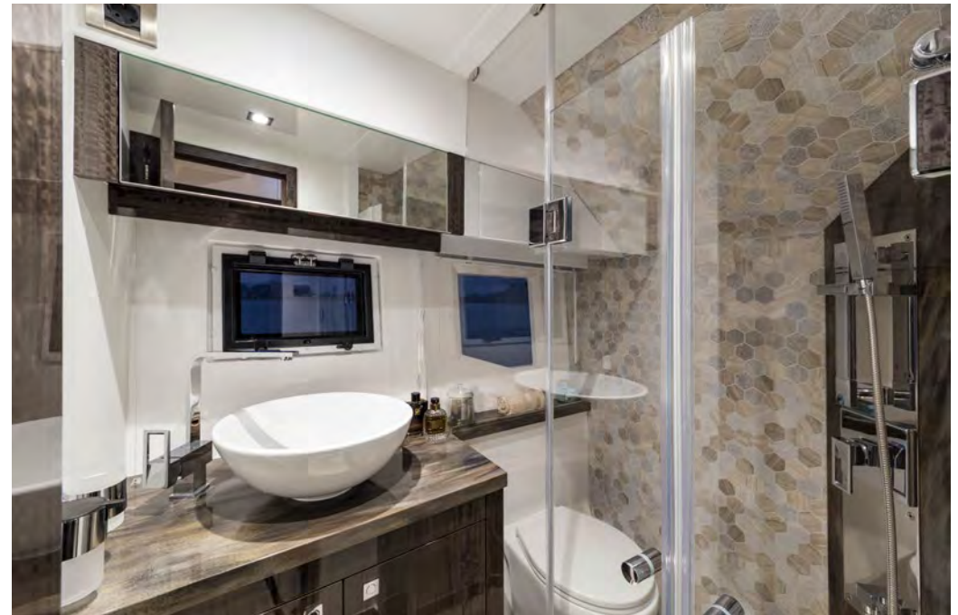
A quality finish and a separate shower will please the guests