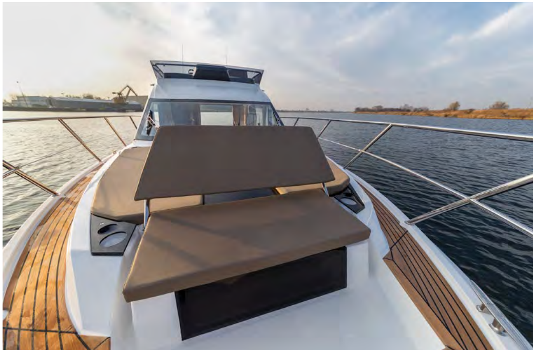
— Prop up the bow seat for a thrilling ride