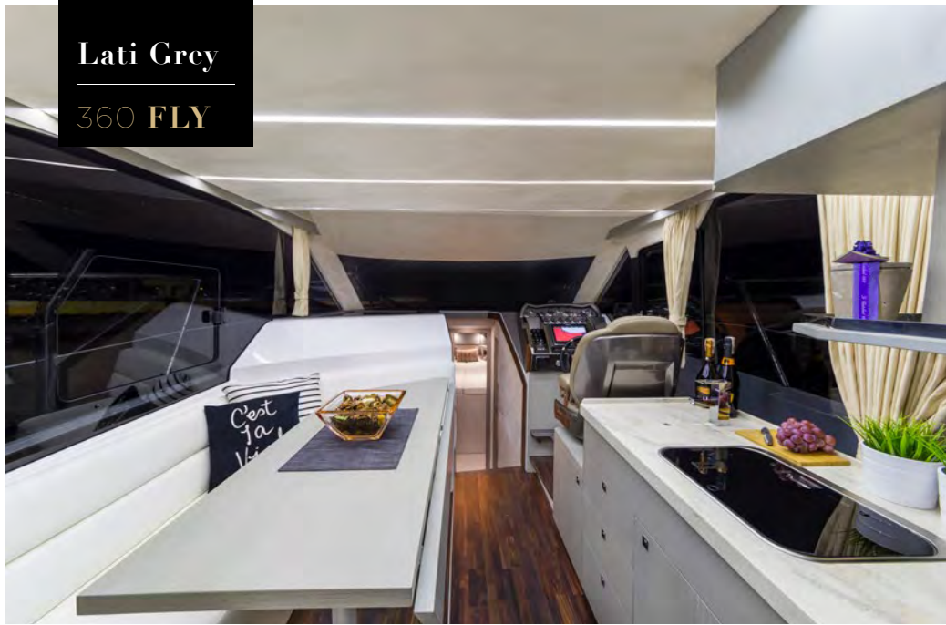
— Find extra storage space all around the main cabin