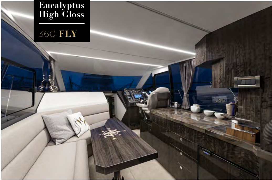
A custom high gloss design shows off the yacht's features