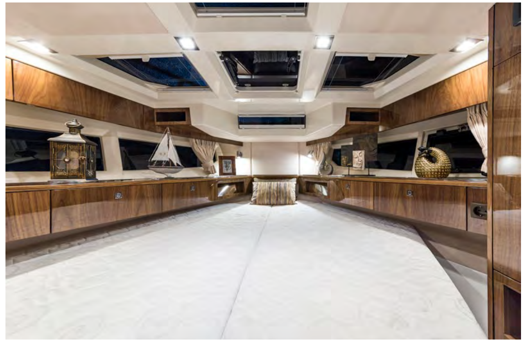
The forward cabin holds a double bed and extra storage —