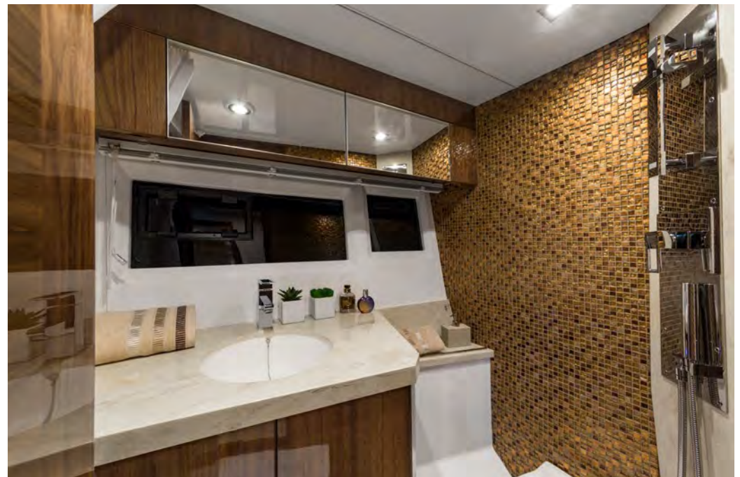
The bathroom comes fitted with a head and a shower —