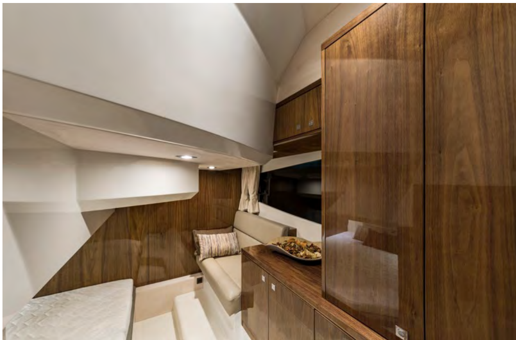
The guest bedroom comes with a large double bed —