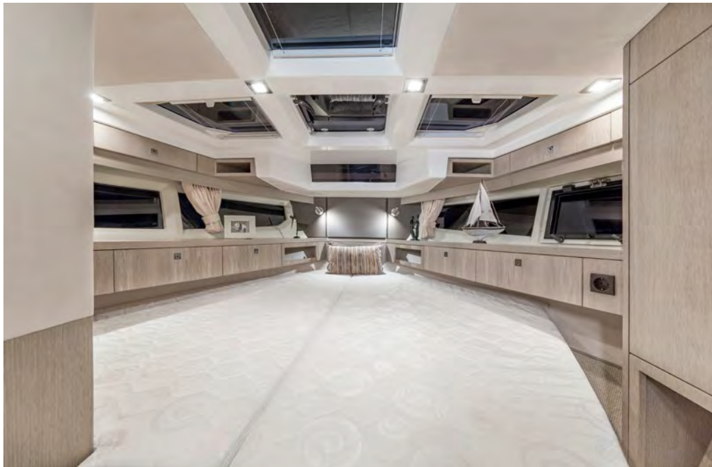
— The main cabin has an abundance of windows and skylights