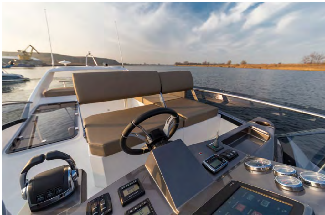
— Double seat at the helm station above