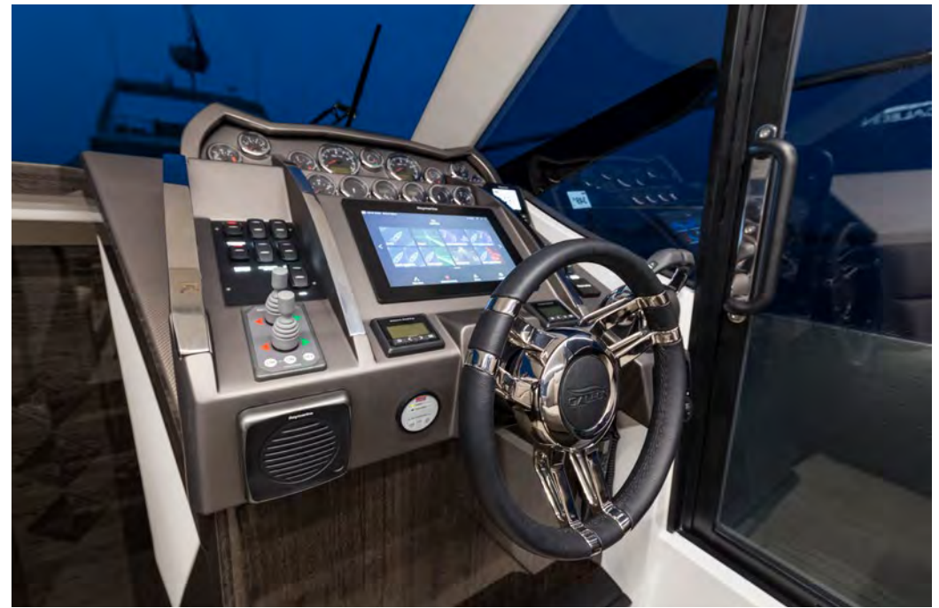
Great visibility and control from the helm