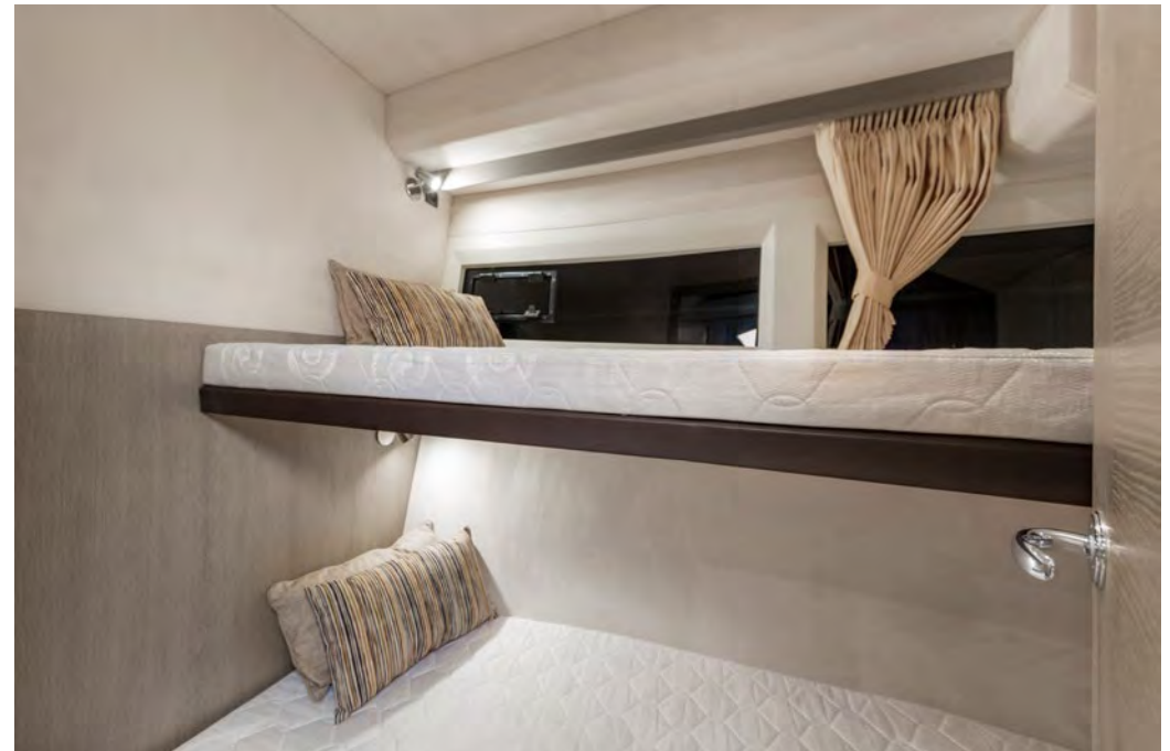
— Bunk beds in the guest cabin down below